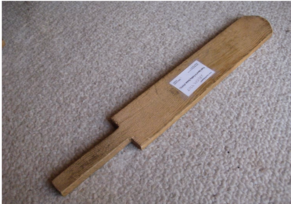
Paddles made from baseball bats (keys indicate size) and standard paddle.