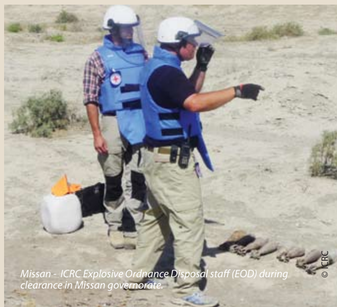
Missan - ICRC Explosive Ordnance Disposal staff (EOD) during clearance in Missan governorate.

Landmines, unexploded ordnance and other lethal debris of war are still a serious threat in Iraq. They add to the many hardships that Iraqi civilians must deal with as a consequence of decades of armed conflict. In 2010, the ICRC stepped up its efforts to help the civilian population get back on its feet by launching an initiative to reduce the impact of weapon contamination. In June 2010, the ICRC started clearing contaminated lands in Missan governorate, in the southern part of the country, one of the worst-affected areas. As the sole humanitarian organization involved in community-level clearance activities in the governorate, the ICRC has removed over 1,600 unexploded shells and bombs from dangerous areas in the districts of Qalat Saleh and Al-Mejar Al-Kabir inhabited by more than 10,000 people.