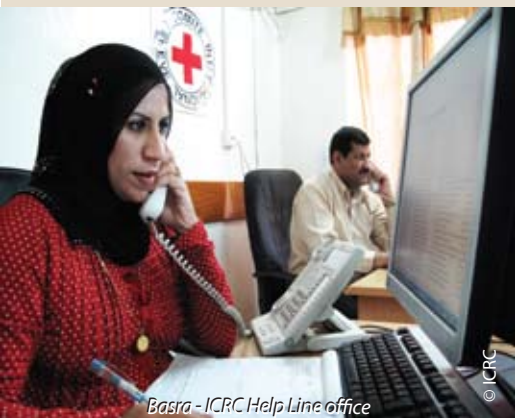
Basra - ICRC Help Line office

For internal use only This map is for information purposes only and has no political significance