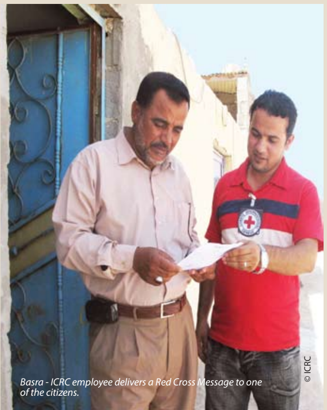
Basra - ICRC employee delivers a Red Cross Message to one of the citizens.

Since 2003, the ICRC has been training local forensic experts in the identification and management of human remains, while supplying equipment and repairing facilities to help the Medico-Legal Institute in Baghdad enhance its technical capacity. In 2010, an official from the Institute attended a forensic genetics course in the UK. In addition, a course on data management was organized for employees of Al-Zubair Centre in Basra.