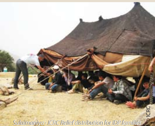
Sulaimaniya - ICRC Relief distribution for IDP families

Visits to tens of thousands of people detained by the Iraqi central authorities, the Kurdish regional authorities and the US Forces in Iraq (USF-I) remained a top priority for the ICRC. In an effort to determine what happened to people missing in connection with the international conflicts during the 1980s and 1990s and to help families still waiting for news, the ICRC continued to provide support to the authorities and to forensic experts.