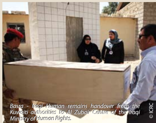
Basra - Iraqi Human remains handover from the Kuwaiti authorities to Al Zubair Centre of the Iraqi Ministry of Human Rights.