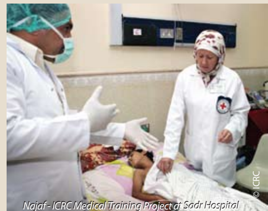
Najaf - ICRC Medical Training Project at Sadr Hospital

The ICRC has been carrying out humanitarian activities in Iraq since the outbreak of the Iran-Iraq War in 1980. The organization works from its delegation in Baghdad and offices in Najaf, Basra, Amara, Erbil, Sulaimaniya, Dohuk, Kirkuk, Khanaqin and Ramadi. In 2010, the ICRC's priority was to visit people detained and to provide the civilian population with relief, while supporting hospitals and repairing health, water and sanitation infrastructure. During the year, the ICRC provided some emergency relief while continuing to provide livelihood support and projects to train and build capacity among Iraqi health professionals.