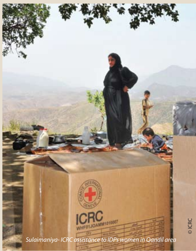
Sulaimaniya- ICRC assistance to IDPs women in Qandil area

The Ministry of Labour and Social Affairs welfare benefit can alleviate the plight of families, but experience has shown that it is often difficult and costly to apply for. In cooperation with local women's NGOs, the ICRC advised and supported women applying for the benefit, and reimbursed their transportation costs. It also maintained a regular dialogue with the ministry and monitored the delivery of the benefit. In 2010, 803 women successfully submitted their applications with help from the ICRC.