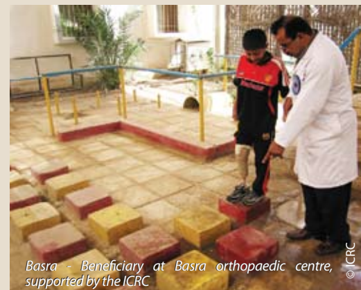
Basra - Beneficiary at Basra orthopaedic centre, supported by the ICRC