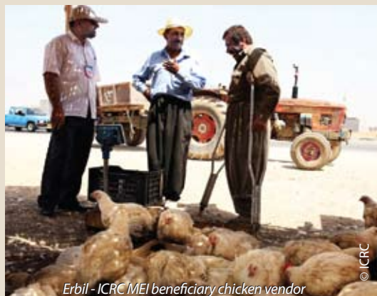
Erbil - ICRC MEI beneficiary chicken vendor