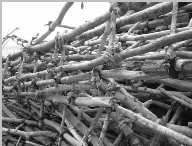
Makeshift ladders abandoned near the border fence, 2005.