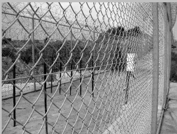
The area between the border fences, 2005.