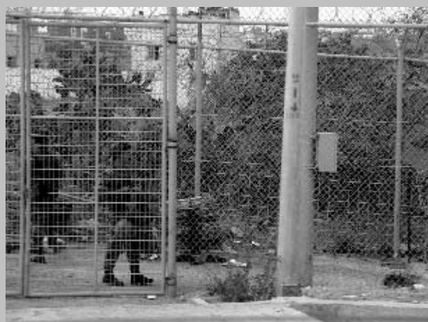
Spanish soldiers patrol behind a gate in the fence at Melilla, Spain, 2005.

This lack of legal clarity has facilitated a number of human rights violations. When people are intercepted by Spanish Civil Guards in the area between the two border fences, they are often immediately unlawfully expelled through one of the gates in the fence closest to Moroccan territory. At no point do they have the opportunity to obtain legal advice nor are they given access to an interpreter as required by Spanish law. In many cases, people have been stopped by Spanish Civil Guards improperly using riot-control weapons or firing shots into the air. Testimonies obtained by Amnesty International describe how Spanish Civil Guards beat people with their rifle butts or shoot at them with rubber bullets from very close range before confiscating their clothes or shoes and handing them over to the Moroccan