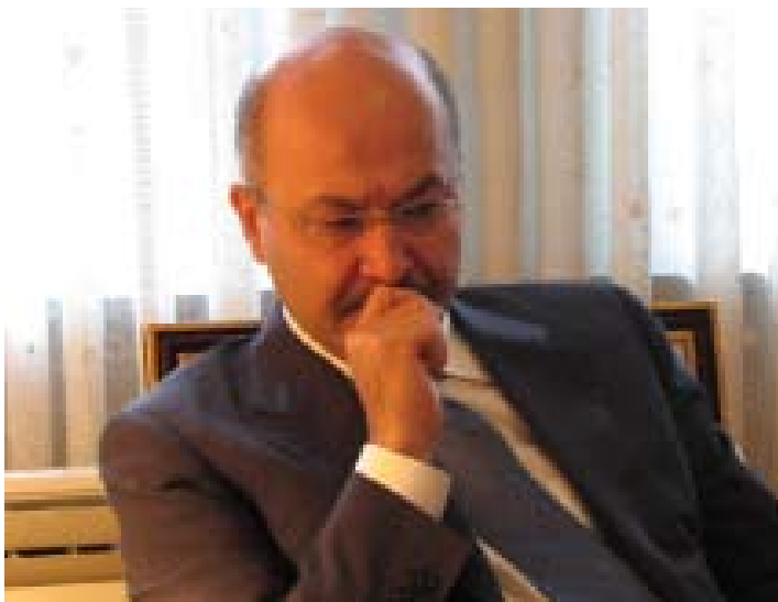
Dr Barham Salih, KRG Prime Minister.

Dr. Barham Salih, the current Prime Minister, stated: "I want a free press, but the current situation is tantamount to anarchy, and that could be used against press freedom. What is necessary is to regulate the current system."