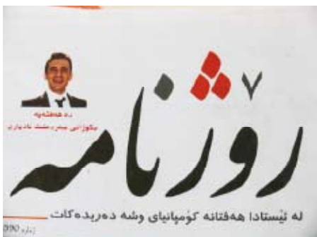
Campaign launched by Rojname .