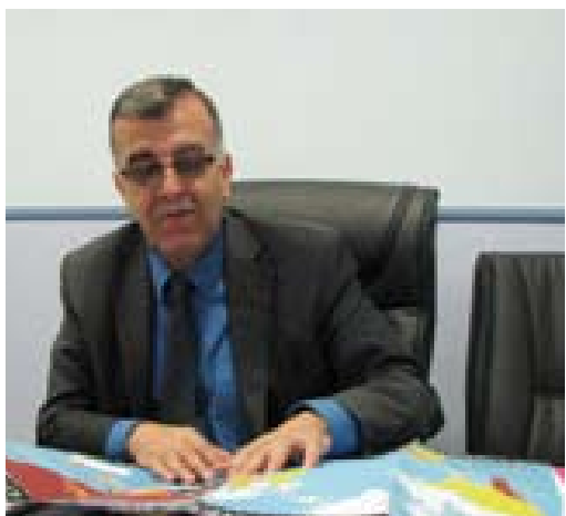
Kawa Mahmoud, KRG Spokesperson and Minister of Culture and Youth. © RWB

During an interview with Reporters Without Borders, Kawa Mahmoud, the KRG Spokesperson and Minister of Culture and Youth, raised the possibility of implementing a general information