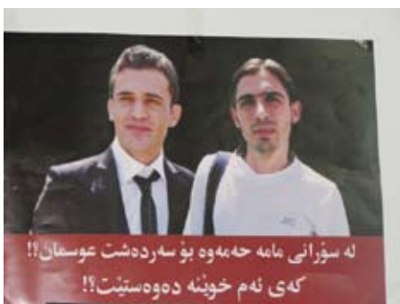
Campaign launched by Awene, Hawlati, Lvin .

During their mission, nearly three months after the murder, Reporters Without Borders' representatives met with the journalist's family, who informed them of their anger and dismay over the inquiry's lack of progress.