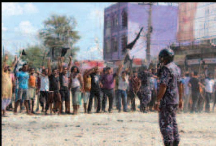
A police officer faces protesters in Nepal’s Terai region in September 2015.

Human Rights Watch calls on Nepali officials to ensure that security forces immediately cease the use of disproportionate force against protesters and establish an independent mechanism for investigating the killings. It urges protesters and protest leaders to take all feasible steps to ensure that all protests are peaceful, and fully cooperate with the authorities in ensuring those responsible for serious crimes are brought to justice. All sides to the underlying political dispute, including protesters and the government, should avoid any action which could incite communal tensions.