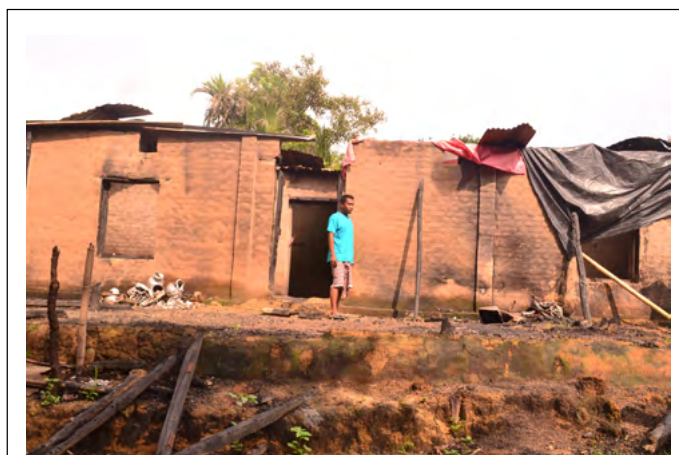
House set on fire during inter-communal violence in August 2013 near Taindong Bazar of Matiranga Upazila in Khagrachari District. Its Pahari inhabitants were among those forced to flee. Photo: (c) Mita Nahar, August 2013

During the 20 th century, millions of people were forced to flee their homes in what is now Bangladesh. They were displaced both within the territory and to neighbouring areas by different triggers. As of January 2015, IDMC estimates that at least 431,000 people were displaced in the country as a result of conflict and violence. Information on their number and situation is limited, contested and outdated, however, with little known about the scale of new displacement in 2014.