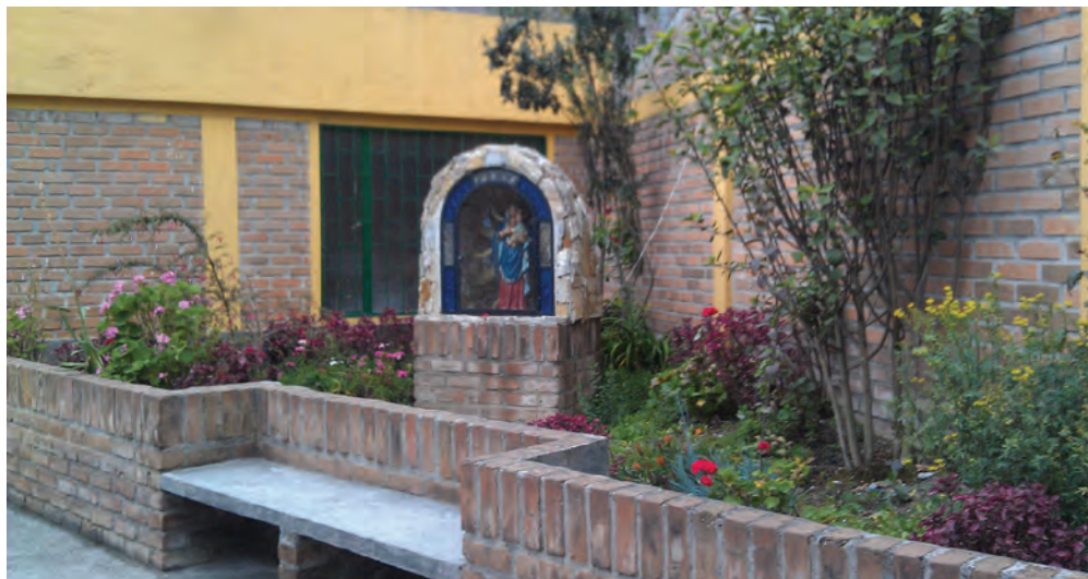
Front courtyard and entrance to a general shelter for internally displaced persons.

further inland via the department of Putumayo. While there is some intraurban displacement in Pasto, the conflict in Nariño still largely follows the traditional lines of the Colombian conflict, in which most displacement is rural to urban.