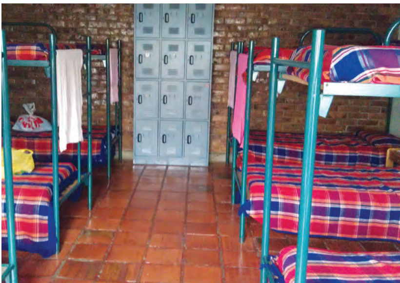
Dorm room at a general shelter serving internally displaced persons.

cerned about coexistence with a diverse group of residents. Many survivors spoke of the challenges of getting along with people from other backgrounds and with different habits. In shelters for the general IDP population, some instances of drug use and child abuse were mentioned, which were sources of stress and concern for survivors. However, serious or disruptive conflicts between residents were rare at shelters.