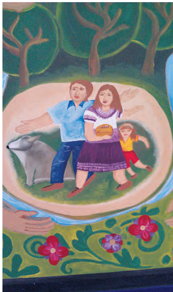
Mural brightening the wall of a shelter for individuals displaced by the conflict.

In all shelter categories, medical care is difficult for residents to access, and many said their medical needs, especially for emergency treatment and medications, often went unmet. Most of the shelters studied have a first-aid kit on-site but do not provide any other medical services in-house. Both