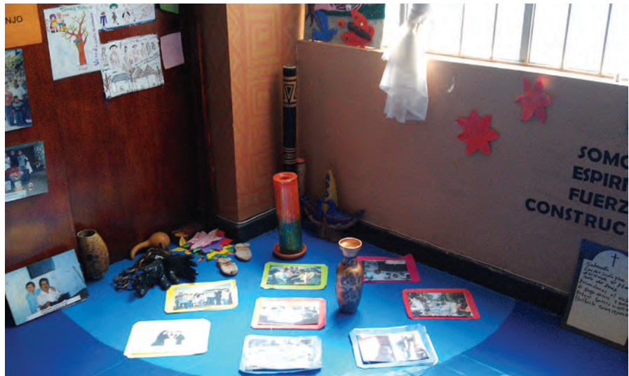
This “memory room” at a shelter for IDPs serves to commemorate residents’ family members who have been killed or have disappeared as the result of conflict-related violence.