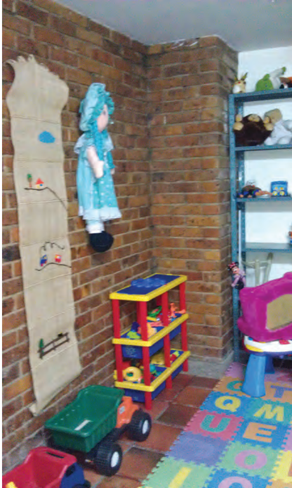
Children's play area at a general shelter for internally displaced persons.

officially registered IDPs and survivors of domestic violence are eligible for publicly subsidized health care. However, the process of actually obtaining this care, especially urgently needed medications or consultation with a specialist, can be lengthy.