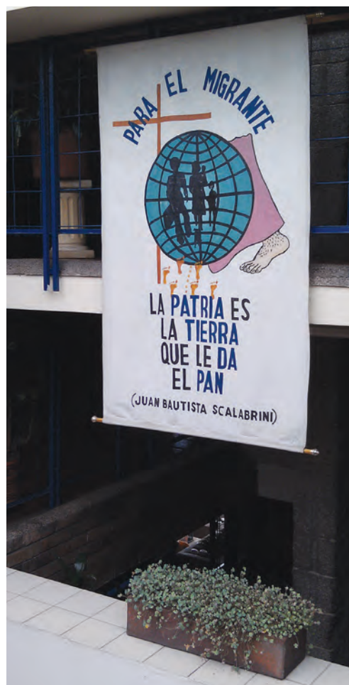
In a general shelter for internally displaced persons, a sign hangs in the atrium: “For the migrant, his country is the land that gives him bread.”

The officially registered population represents only a fraction of the total of displaced persons in Colombia. The United States Agency for International Development (USAID), for example, estimates that 60 percent of internally displaced persons in Colombia are not registered—and thus do not receive government assistance—due to lack of information about available services or the registration process, fear of coming forward, or failure at the time of registration to provide government-issued identification, which many rural residents do not have. 49 A study ordered by the Constitutional Court also found that more than half of the displaced population is not registered due to high rates of rejection, in part because those who report that they were displaced by state actors are not counted in the registry. 50 Fur-