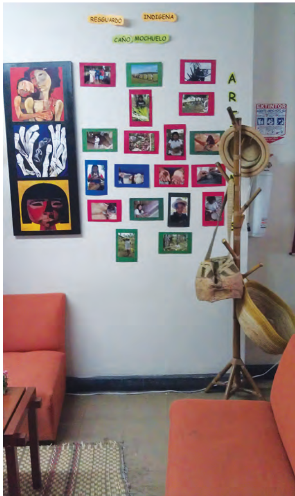
Waiting room of a shelter designed to serve internally displaced persons with high security risks.

For survivors of displacement, including survivors of sexual and gender-based violence, the government makes referrals and provides funding to private shelters operated by religious organizations and private nonprofit organizations. The Unidad de Atención y Orientación a la Población Desplazada (Assistance and Orientation Unit for the Displaced Population) (UAO) is the first stop for displaced persons in Colombia, and it makes referrals to a number of services, including shelters. According to UNHCR staff, there are five UAOs in Bogotá, and there is not much coordination among them. UAO staff report that they see, on average, two hundred displaced people a day and are not able to attend to all of them.