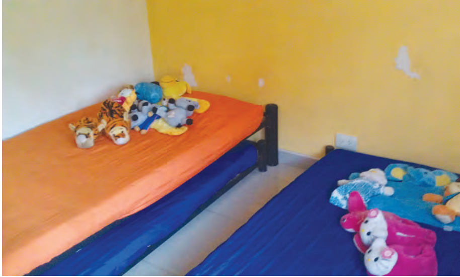
Children's bedroom in a community host family home in Medellín.

by Colombian standards. According to staff in the Secretariat of Women in the Medellín mayor's office, the office had been working on this issue for ten years. Effective organization among women's groups in the city pushed the government to place more importance on the issue, and that, together with visionary leadership from the then-head of the Secretariat of Women, eventually made the shelter program possible.