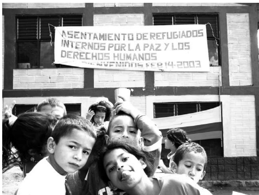
The community school in La Honda. The sign reads “Settlement of internal refugees for peace and human rights. Welcome. February 14 2003.

The consolidation of a paramilitary presence in the La Cruz and La Honda areas had been hampered by the presence in these communities of various local and international human rights NGOs. For this reason, Colombian and foreign human rights activists accompanying these communities have faced repeated threats and attempts to open legal proceedings against them on the basis of spurious information from military intelligence.