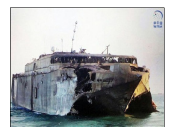
Image of HSV-2 Swift after it was attacked by Houthi-Saleh forces.