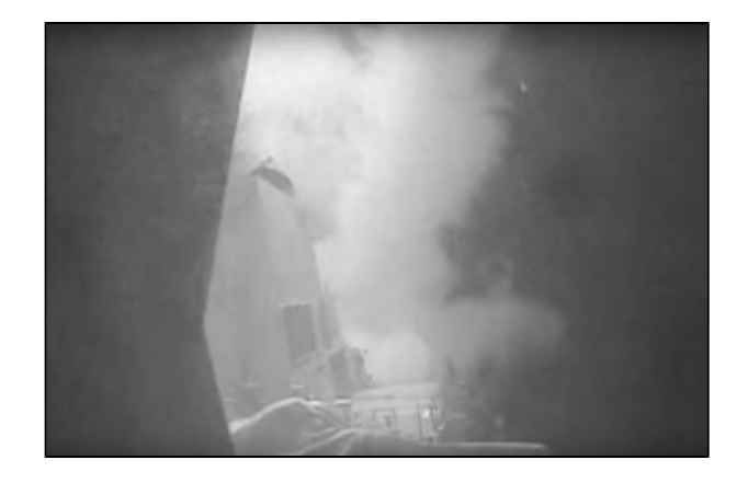
A Tomahawk Land Attack Missile Launched from USS Nitze against Houthi-Saleh radar.

Claiming self-defense, the USS Nitze fires Tomahawk cruise missiles at three Houthi-Saleh-controlled radar installations, A Pentagon spokesperson says, "These limited self-defense strikes were conducted to protect our personnel, our ships and our freedom of navigation in this important maritime passageway," Other U.S. officials reiterate that U.S. actions do not indicate deeper U.S. support for the Saudi-led coalition or deeper military involvement in the conflict.