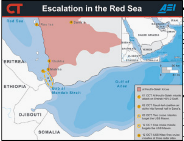
Figure 1. Escalation in the Red Sea

Based on recent events, it would appear that the costs of the war in Yemen are spilling beyond its borders. Around 4% of global oil exports pass though the Bab al Mandab strait, the humanitarian situation in Yemen is dire and, if conflict in the Bab al Mandab were to continue, global shipping would have to be rerouted, thereby potentially driving up oil prices.