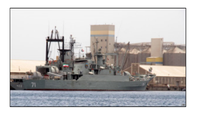
Iranian warships Alvand (right) and Bushehr

Claiming self-defense, the USS Nitze fires Tomahawk cruise missiles at three Houthi-Saleh-controlled radar installations, A Pentagon spokesperson says, "These limited self-defense strikes were conducted to protect our personnel, our ships and our freedom of navigation in this important maritime passageway," Other U.S. officials reiterate that U.S. actions do not indicate deeper U.S. support for the Saudi-led coalition or deeper military involvement in the conflict.