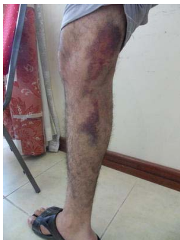
Marks on the leg of a former detainee who alleged torture. Bahrain, April 2011

In June 2012, the newly formed BICI Follow-up Unit issued a report documenting the progress made in implementing the recommendations of the BICI report. According to the BICI Follow-Up Unit's report issued in June 2012, in addition to 122 cases referred by the Ministry of Interior (MoI) and the National Security Agency (NSA) in February 2012, the SIU received an additional 45 complaints. Some 126 complainants were interviewed and 50 of them referred for forensic medical examination. Seventy-seven suspects were also questioned and investigations resulted in charges being brought against 21 policemen and officers. 6