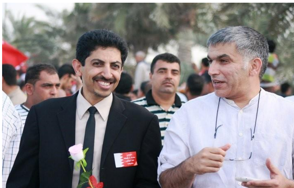
Abdulhadi al-Khawaja and Nabeel Rajab at a pro-democracy march, Bahrain, 22 May 2011