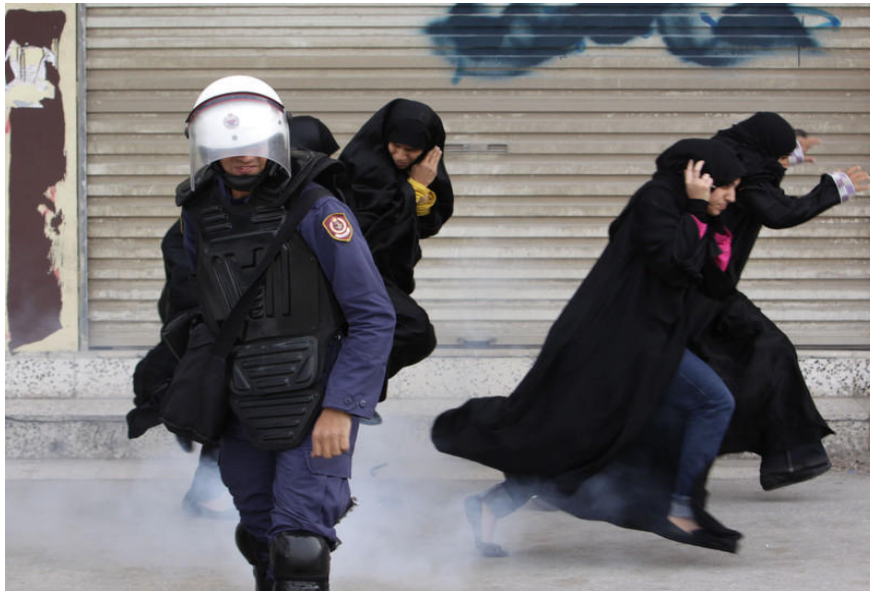
Bahraini anti-government protesters react as riot police throw sound bombs at their feet to disperse them Friday, Feb. 17, 2012

Ali Hussein Neama’s family member, September 2012