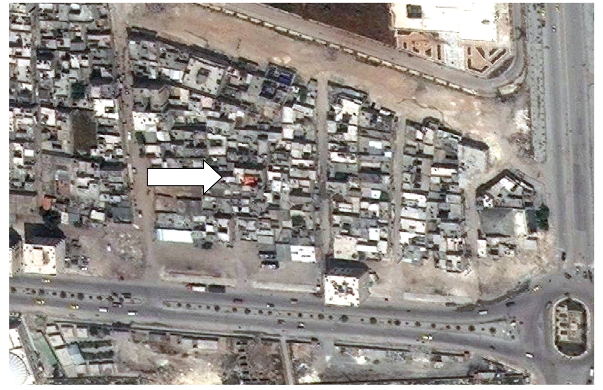
Digital Globe World View 1 – 13 May