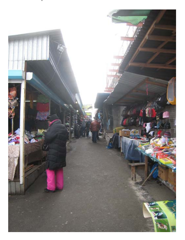
Zhulyavska market in Kyiv where many migrants and asylum-seekers work

However, the true extent of racist crimes in Ukraine remains hidden. There are no accurate statistics on the number of racially motivated crimes and racist incidents reported, nor are there any statistics about how many of those complaints were actually prosecuted and under what charges. In November 2009, the Ministry of Internal Affairs replied to an enquiry from Amnesty International stating that only two racist crimes had been recorded during the first nine months of 2009. This figure refers only to those crimes qualified under Articles 161 (Violation of citizens' equality based on their race, nationality or religious preferences) and 180 of the Criminal Code (Interference in Religious Ritual), and gives no indication of the scale of the problem.