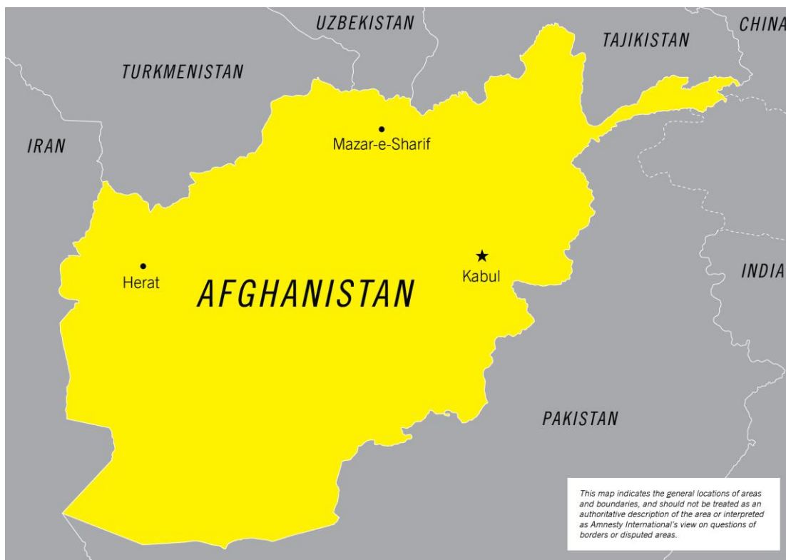
Map of Afghanistan, with the Herat, Kabul and Mazar-e-Sharif marked – the towns visited by Amnesty International for this report.