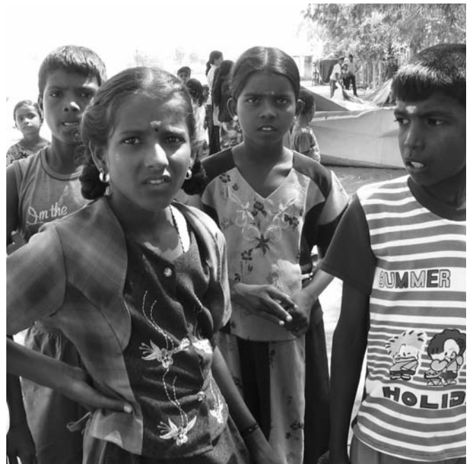
Tamil children in IDP camp , eastern Sri Lanka.

The specific emphasis in this paper on militant action and the government's response to it. This is not to deny the existence of several other types of violations and humanitarian issues that exist in Sri Lanka. But the government's continuing violations of human rights in the guise of a 'war on terror' deserves serious attention, particularly on the manner in which the government's position has turned into a war against minorities. The counter terrorism climate and the violent response of the rebels has defined much of 2007. Terrorism is a pressing aspect of the country's current predicament, while counter