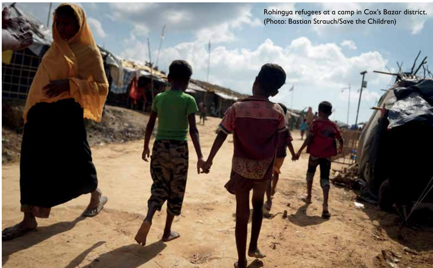
Rohingya refugees at a camp in Cox's Bazar district.

“I try to be strong for them as I am the oldest. When we arrived in Bangladesh we knew we were safe now.”