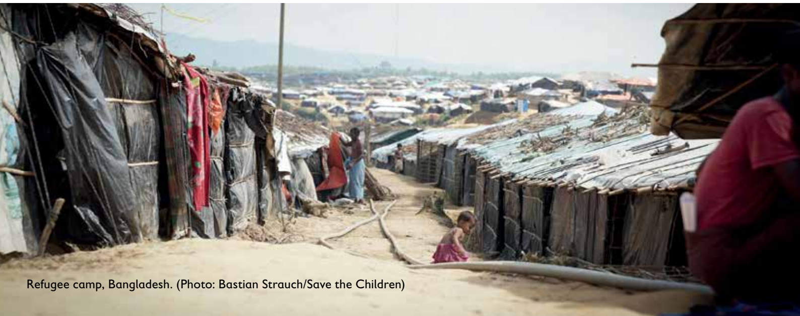
Refugee camp, Bangladesh.

“Right now if anyone goes back we are worried that it will just happen again. We want to live our lives in peace. We want to be free from fear. Please help us. We beg you. We just want to live in peace.”