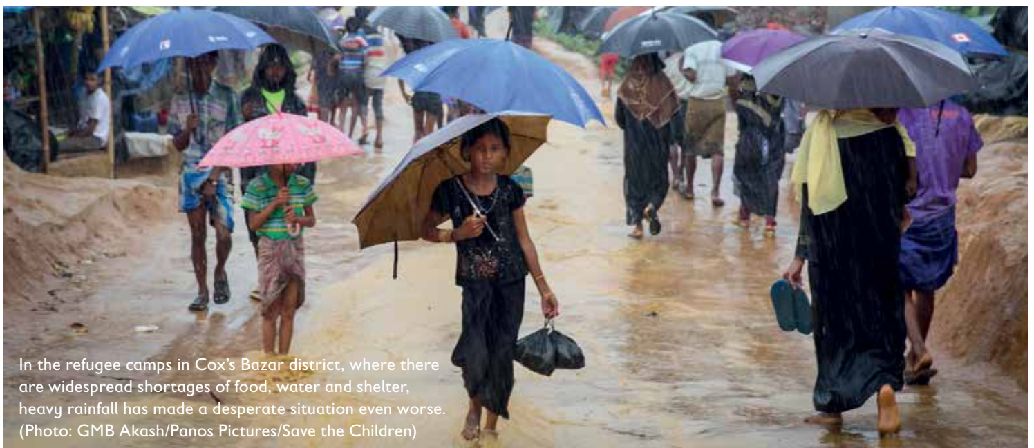
In the refugee camps in Cox's Bazar district, where there are widespread shortages of food, water and shelter, heavy rainfall has made a desperate situation even worse.

Warning: This report contains content relating to violence against children and adults, including sexual violence, that some readers may find distressing.