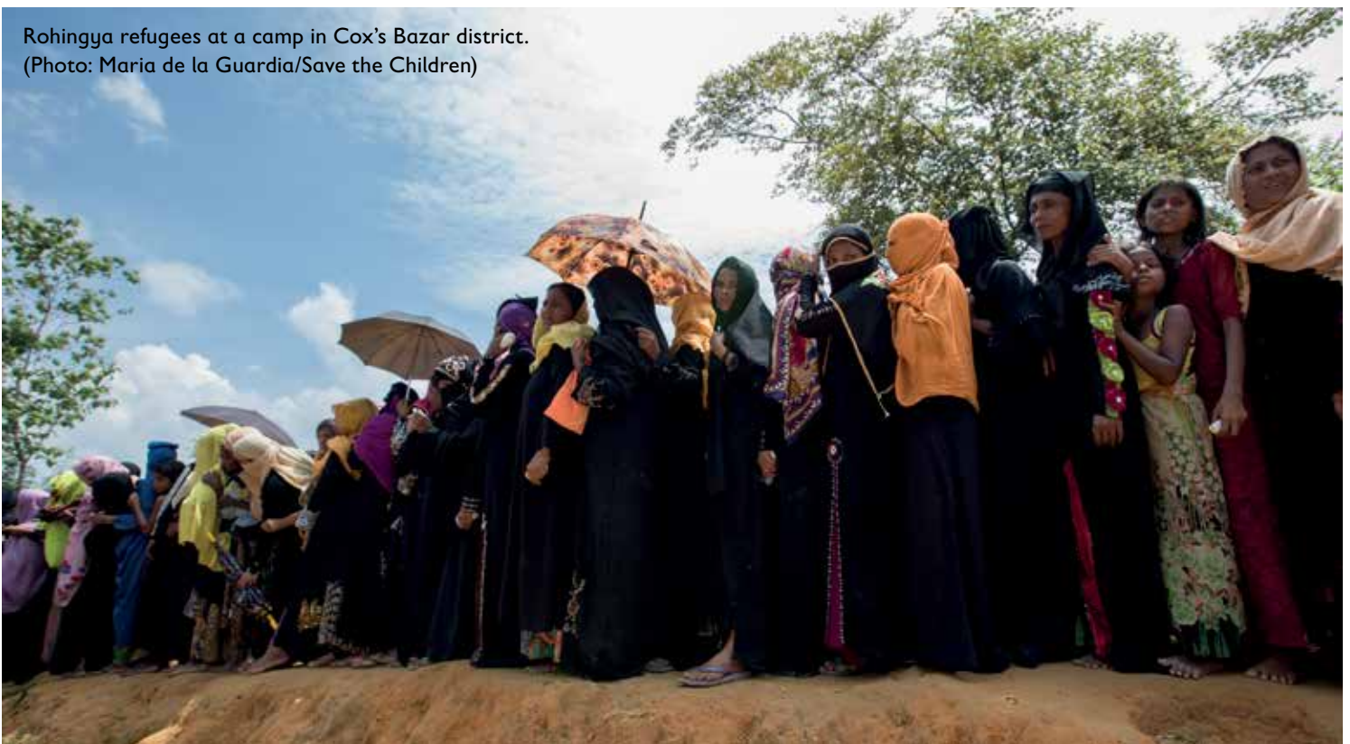
Rohingya refugees at a camp in Cox’s Bazar district.

“It took us 15 days to get to Bangladesh. The whole way my daughter was crying. She needs urgent medical attention. She has really bad burns on her upper legs and in her genital area. She is in so much pain.”