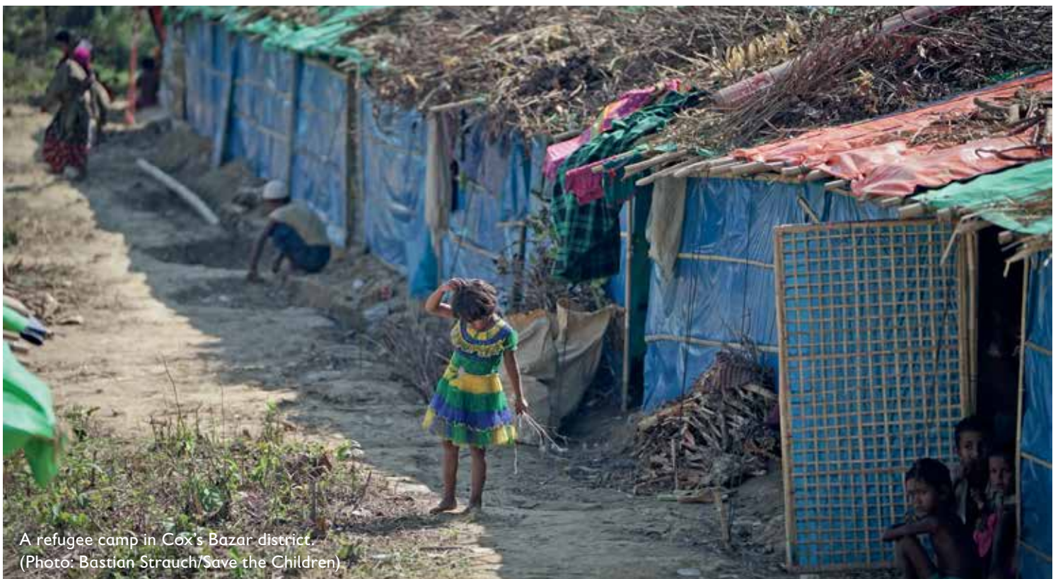
A refugee camp in Cox's Bazar district.