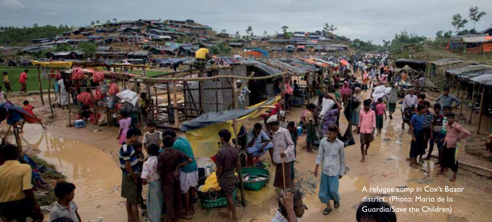
A refugee camp in Cox's Bazar district.