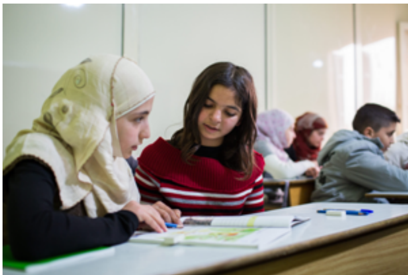
Syrian refugee children in a second shift class supported by UNHCR in Lebanon .

In Morocco , the “End Violence” campaign was launched in November 2014 to combat violence against children. In Jordan , UNHCR, UNFPA and UNICEF have promoted the establishment of joint SGBV and Child Protection (CP) Standard Operating Procedures and case management tools to ensure timely access of child survivors to specialized services. In the UAE , UNHCR partners with the authorities to expedite refugee status determination, durable solutions processing, and prompt access to medical care for vulnerable children, including those at risk of SGBV. In Egypt , UNHCR, through its implementing partners, conducted sensitization sessions on prevention of child abuse and child sexual abuse using age-appropriate learning methodologies for children and simultaneous sessions for their caregivers.