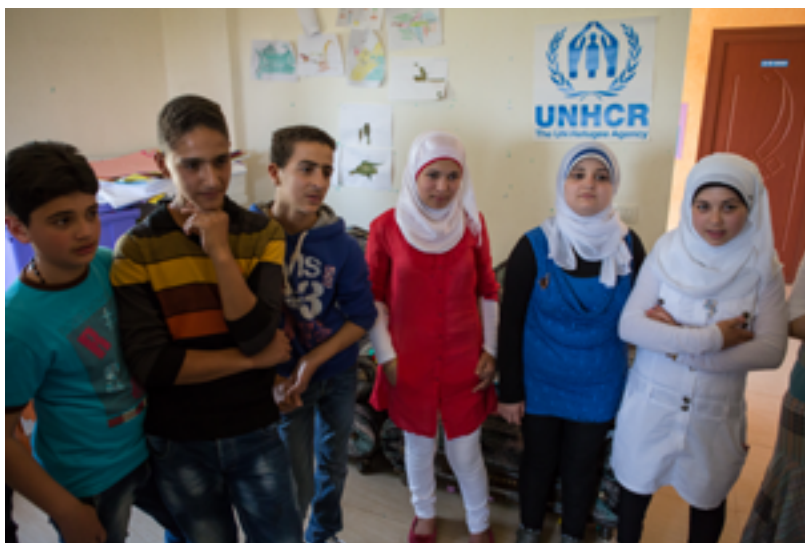
Young Syrian Refugees in Lebanon discuss the topic of early marriage .

Early marriage not only deprives girls of the opportunity to education, it increases their socio-economic vulnerability, further exposes them to sexual and gender based violence, and limits their future prospects. Young girls who become pregnant are at high risk of maternal mortality and other complications during pregnancy and childbirth.