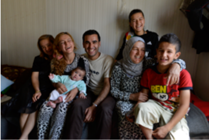
Syrian family in Basirma refugee camp in Iraq

In Egypt , for instance, UNHCR has supported participatory planning efforts that bring communities together to jointly identify the needs in their communities and develop community-based solutions to address issues of concern, including SGBV. In Syria , after focus group discussions found that SGBV was a significant concern community members began enhancing privacy and security by installing alternative lighting and room partitions in collective shelters. In Iraq , refugee camp committees play an active role in ensuring the safety and physical security of the camp. They