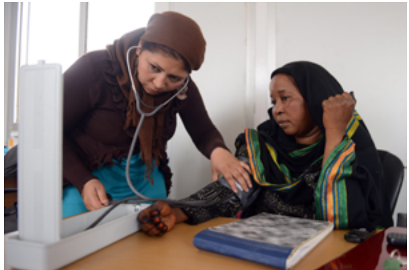
Libyan refugee has access to multi-sectoral services in Egypt.

In Yemen , UNHCR partners support SGBV survivors through individual and family interviews, psycho-social counseling, legal, financial, material assistance, and referral to other services when needed. In Morocco , UNHCR provided assistance to SGBV survivors that are found in mixed migratory movements. UNHCR and partners support the distribution of “dignity kits” to women and girls in detention facilities, and provision of medical assistance to address their specific needs of SGBV survivors in Libya .