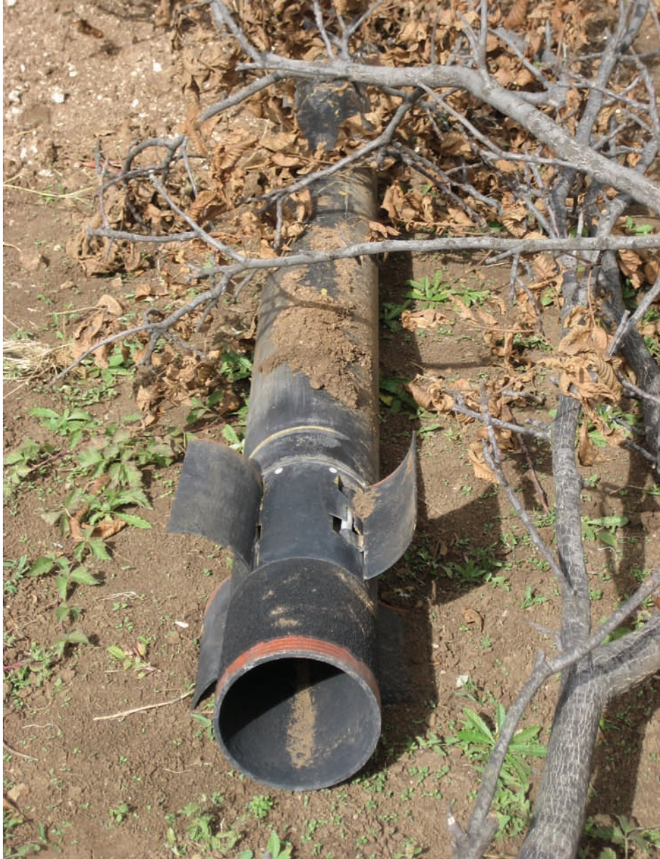
A Mk-4 160mm rocket lies in a field in Ditsi on October 17, 2008. Bought from Israel and launched by Georgia, the rocket carries 104 M85 submunitions.