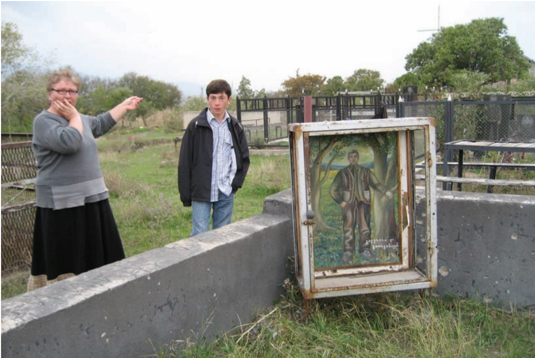
A woman injured during a Russian cluster munition strike on Ruisi on August 12, 2008, points toward the tree where she and three other women, also injured, had sought shelter. The gravestones of the adjacent church cemetery, pictured here on October 15, 2008, had holes from 9N210 fragmentation. The boy in the photograph came to report a nearby submunition dud.