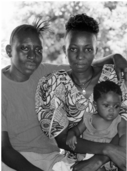
Despite serving with the fighting forces during the war, many girls and women have been left out of DDR services because they were considered non-combatants.

Despite their distinct experiences within the fighting forces, no comprehensive programs existed to help girls and women make considered decisions about their “AK-47 marriages.” Apart from a handful of micro-credit schemes targeted at women serving with the fighting forces, no comprehensive approach or