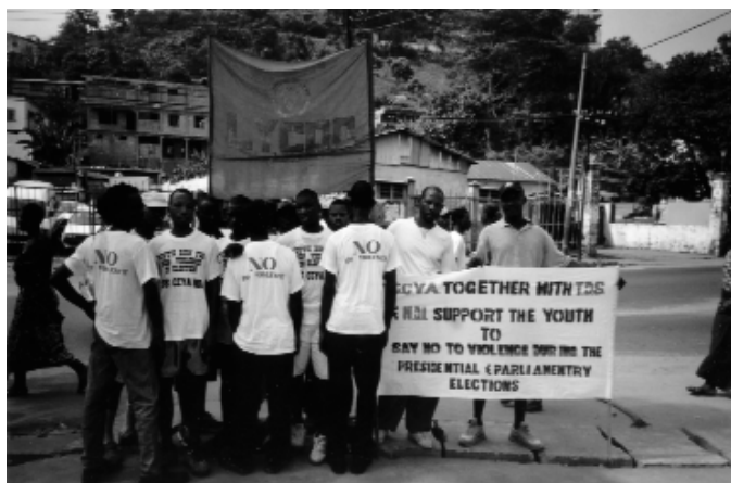
Young people want to move beyond marginalization to real participation in society. Here they came together to support non-violence among youth during the May 2002 presidential and parliamentary elections.

The consequences of this exploitation are deep and