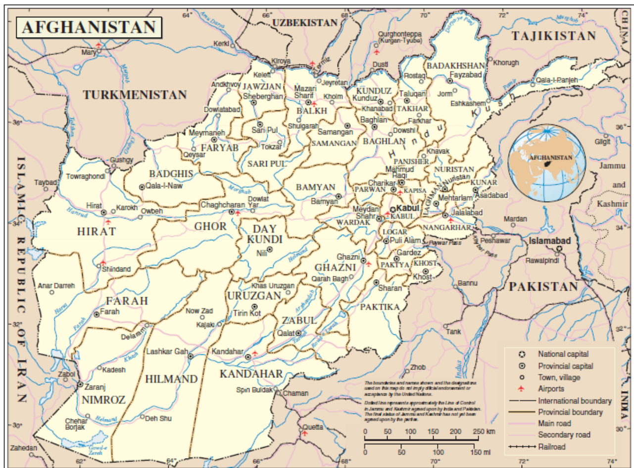
Map No. 3958 Rev. 6 UNITED NATIONS July 2009

Department of Field Support Cartographic Section