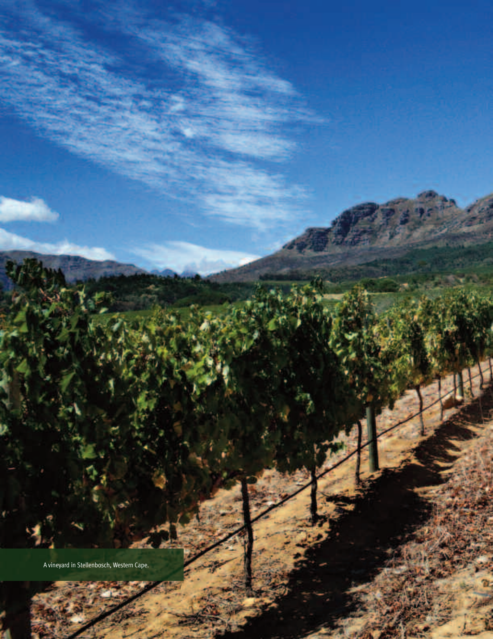
A vineyard in Stellenbosch, Western Cape.