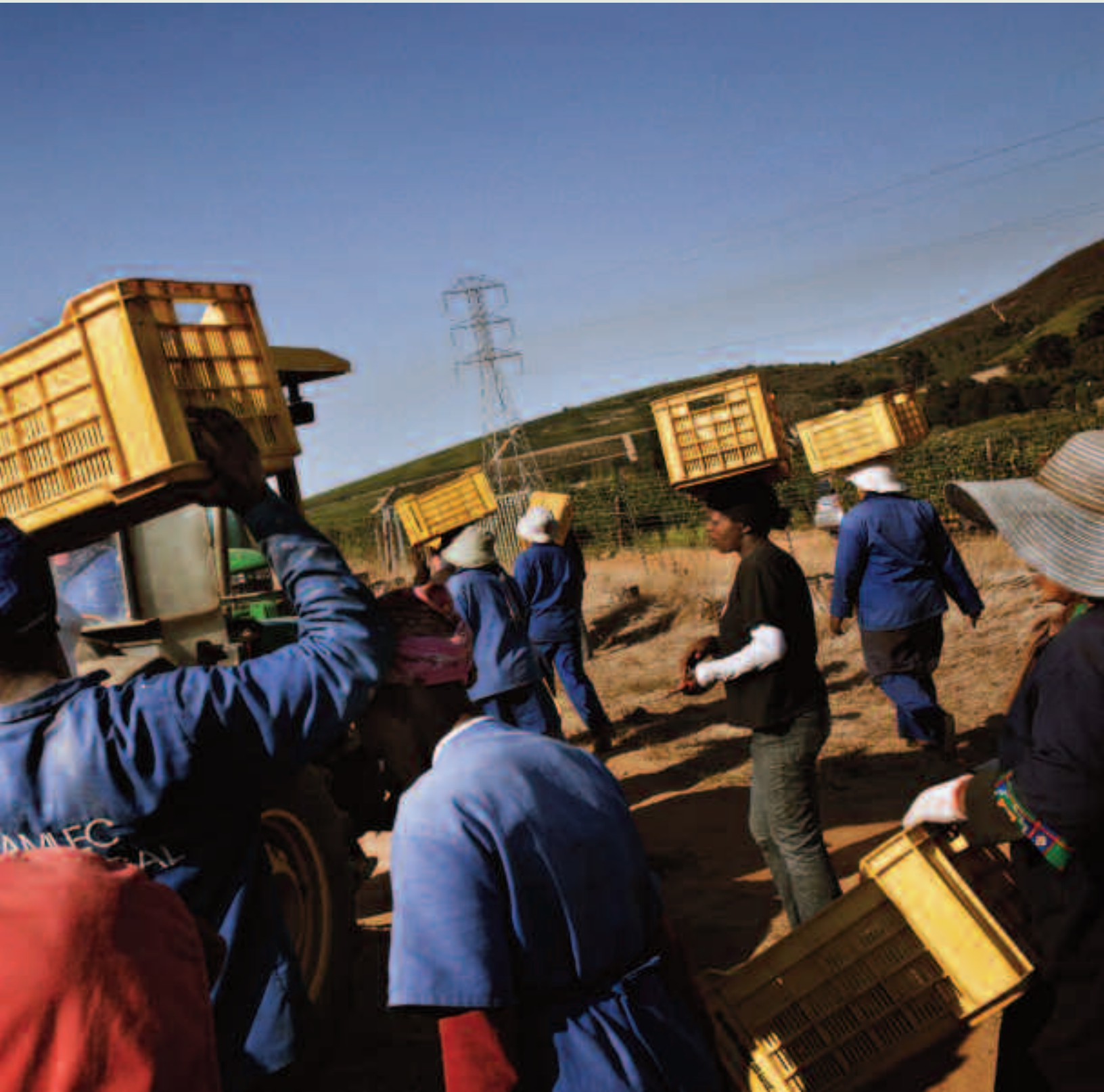
Farmworkers in Stellenbosch collect grapes during harvest time.