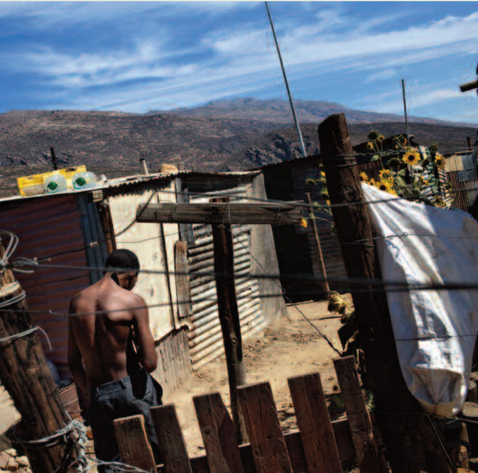
A resident of Stofland township returns home.