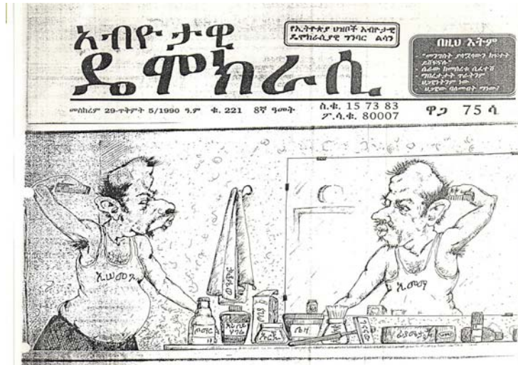
On the character on the left's tee-shirt: "Isamagu" = human rights; on the right, in the mirror, the Ethiopian Teachers' Association; on the bottles, names of independent newspapers.