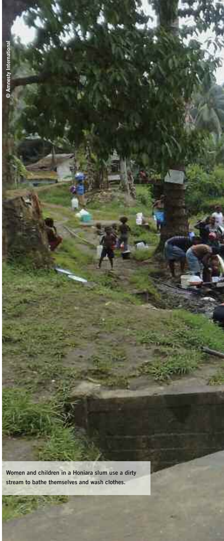
Women and children in a Honiara slum use a dirty stream to bathe themselves and wash clothes.

The lack of adequate water supply and proper sanitation in Honiara's slums contributes to disease, threatens safety and denies dignity to these residents. The government must take immediate steps to ensure access to clean water and adequate sanitation for people living in slums.