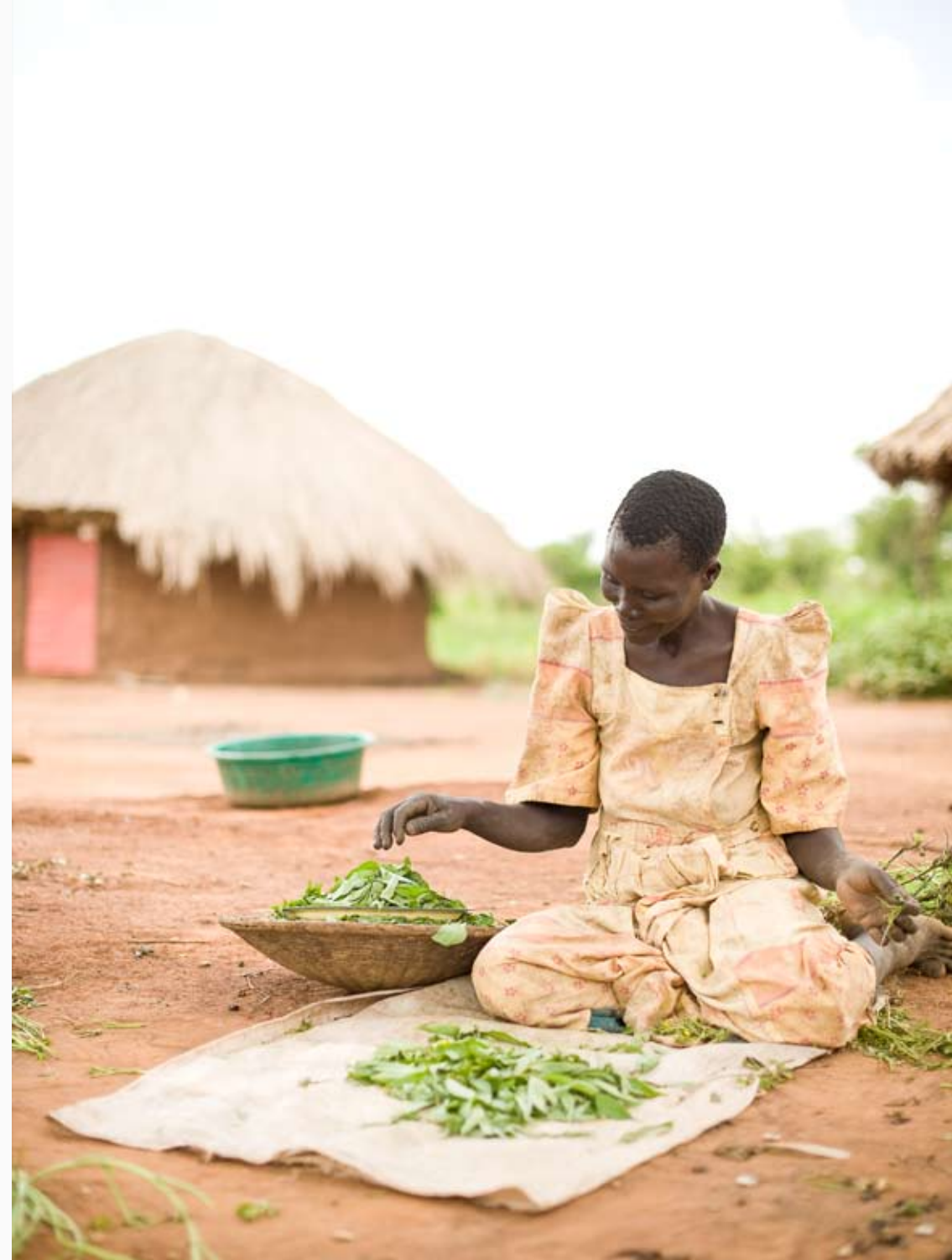
A mother of four and grandmother of five prepares boo, a local green, for her family in Gulu district.

The aim of the program is to maximize the involvement of the returning community in order to facilitate the reintegration of the vulnerable individual within the community. Beside the provision of shelter, the program intends to identify the caregivers of the assisted Persons with Specific Needs (PSN) in order to provide them the needed support also in the villages of origin where external assistance may be nonexistent. One thing is clear: the difficult process of re-composition of the social structure has begun now with the returns in Acholiland.