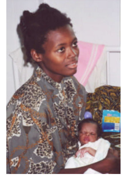
IDP girl with malnourished baby, Luena maternity, Moxico Province February 2001

MSF has a safe motherhood program in Luena but it is limited to prenatal care and vaccinations for children and infants. The MSF safe motherhood program does not include family planning (e.g., to support birth spacing). The MSF representative in Luena explained: