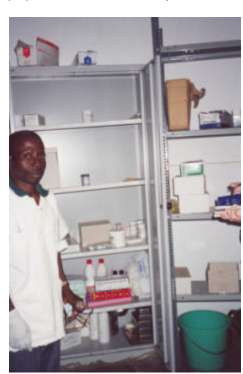
Near empty supply cabinet in IDP camp health post in Luena, Moxico. February, 2001

The Angolan government needs to allocate more resources to health and education. This is one of the richest countries in the world in natural resources and vet the government has only committed 5.5% of its budget to health. We were told that so far this commitment is on paper only and that the actual contribution will likely be much less. Regardless, 5.5% does not come close to meeting the needs of Angolans for health services. It is guite discouraging for international NGOs to maintain or increase the social services they are providing to the Angolan people (including IDPs) when there is no reciprocal effort being made by the government.