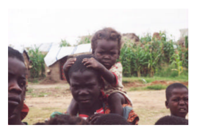
IDP youth in Luena, Moxico, February 2001