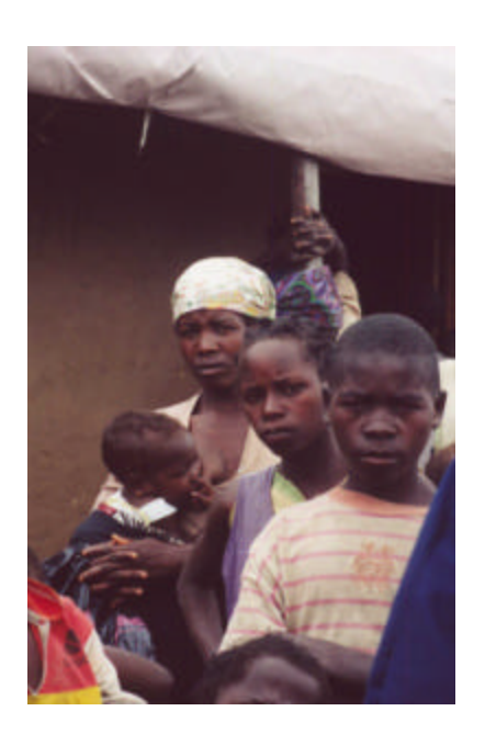
IDPs in Kuito, Bie waiting for health services, Februrary 2001