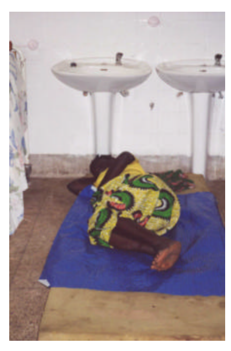
IDP woman in Luena maternity, Moxico Province, February 2001

Angola has one of the highest maternal mortality ratios in the world, estimated at 1,500 per 100,000 compared to bordering Namibia at 370 per 100,000 and Canada at 5 per 100,000.9 This should not be surprising, since fertility rates are high, use of family planning is low, ante-natal care is not widely available, and many women do not have access to emergency obstetric services. UNFPA-Angola produced a report in June 1999 titled The Demographic Profile and the Reproductive Health of the IDPs. The findings of this report are based on interviews with 1,422 IDPs in Huila, Benguela, Malanje and Zaire provinces. 10 This study reports that the average number of children per woman interviewed was 8.6. The infant mortality rate is 125 per 1.000 in Angola, whereas in Canada, for instance, it is 5.5 per 1,000.11