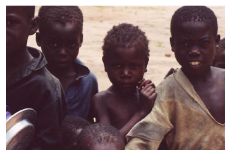
IDP children, Luena, Moxico, February 2001

Safe Motherhood - There is, as in most every part of the world, a very strong preference for boy babies. In this setting the preference