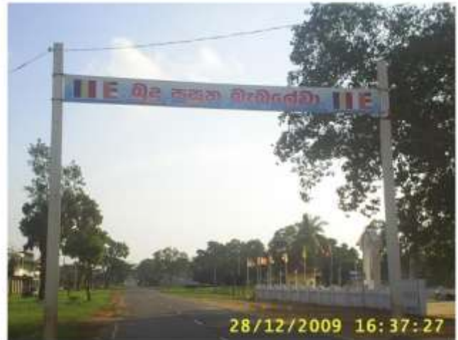
Arch proclaiming the greatness of Buddhism across the A9 road in Killinochi