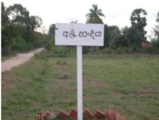
Sinhalese signboard announcing a new Sinhalese name for an old Tamil village in the Mankulam – Mullativu road (Reason given by Army Captain: Tamil name is too long and difficult to pronounce)