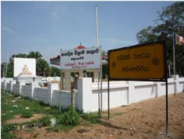
Buddhist Temple after renovation in the middle of Killinochi town