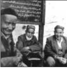
Muslim men at a mosque in Kashgar, Xinjiang