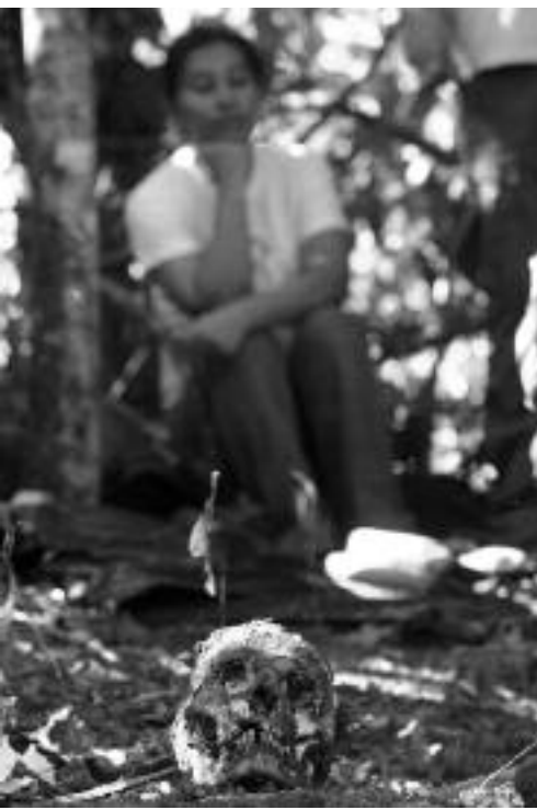
Exhumation in 2007 in San Carlos, Antioquia Department, of the remains of campesinos killed by paramilitaries.

On 14 June 2008, members of the ACN again entered the hamlet of San José de la