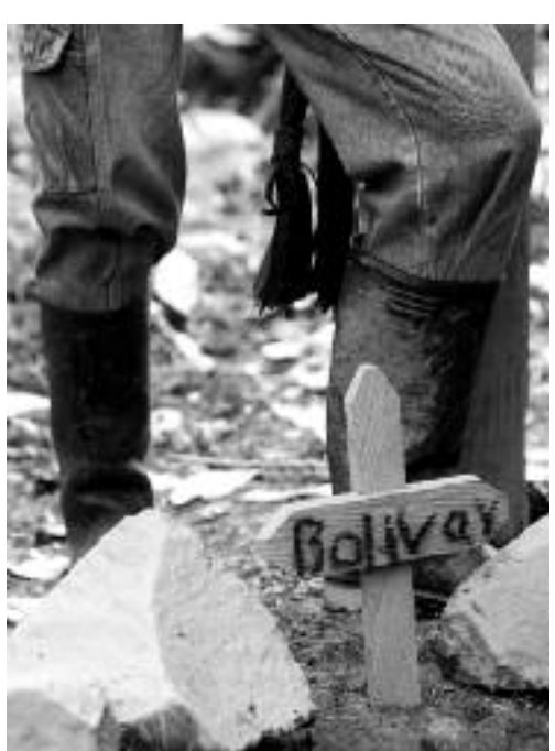
The cross marks the place where the bodies were found of five of those killed in the massacre of the Peace Community of San José de Apartadó, Municipality of Apartadó, Antioquia Department, in February 2005.

"With regard to the events that have taken place in San José de Apartadó, it is evident that the State has not done enough to prevent the Community from being a victim of so many crimes. The failing in their duty to provide protection is very serious. Equally serious is the lack of results achieved during the criminal investigations initiated after these crimes took place".<sup>71</sup>