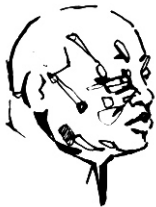
Ambrose Riiny Thiik is Former Chief Justice of South Sudan