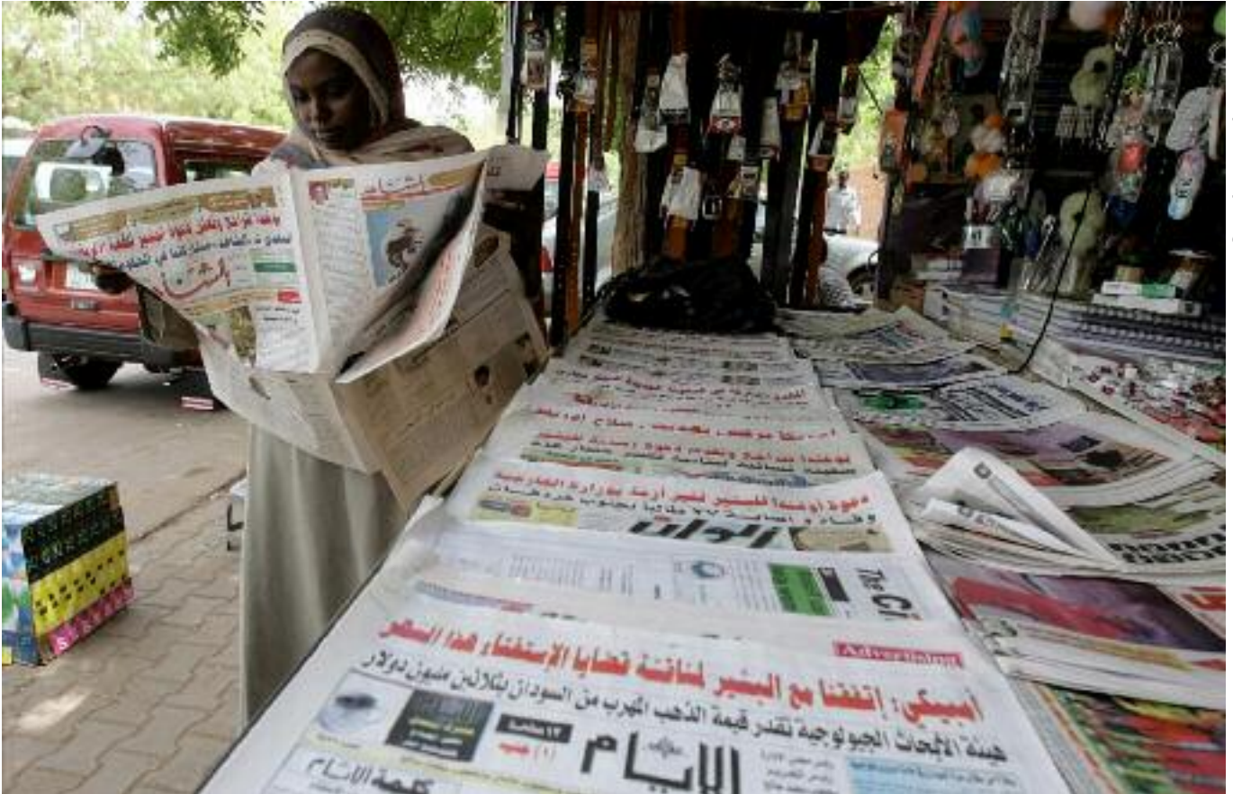
A Sudanese woman reads a newspaper in Khartoum.