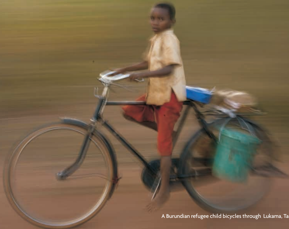
A Burundian refugee child bicycles through Lukama, Tanzania

Basic services were maintained at high standards, mortality remained low and the incidence of malnutrition and malaria was reduced. HIV and AIDS prevention and control measures helped lessen the prevalence of HIV. The Office conducted Best Interest Determination procedures and traced family members for every unaccompanied minor and separated child registered for repatriation. Robust measures to prevent sexual and gender-based violence and fight impunity have led to a notable increase in awareness of sexual violence and a reduction in the number of reported incidents.