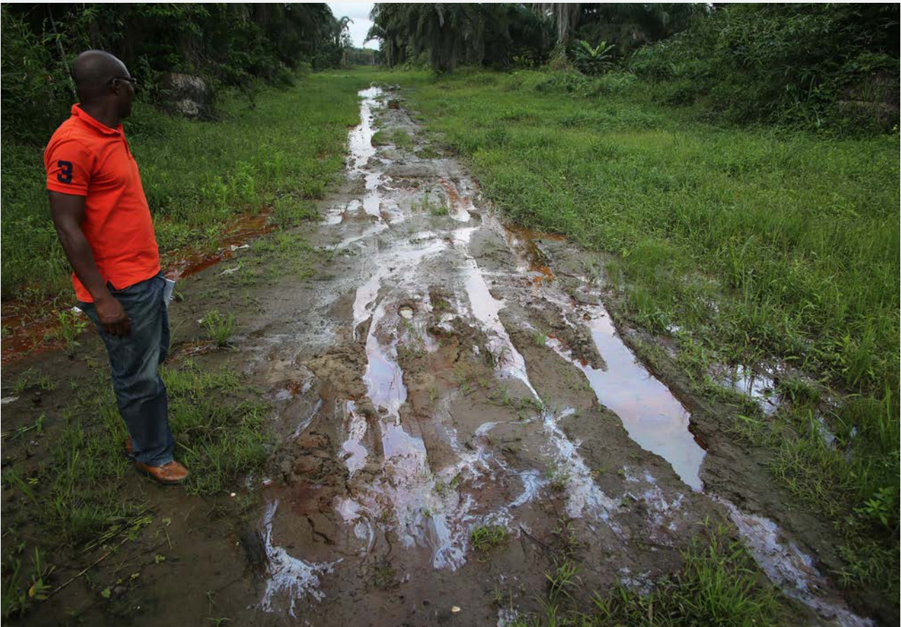
Stream at Barabeedom swamp is visibly contaminated with oil. August 2015

When UNEP investigated Barabeedom swamp in 2010, it found high levels of soil contamination, penetrating to as deep as five metres. The maximum level of soil contamination discovered by UNEP was more than eight times the level at which the Nigerian government requires intervention. 87