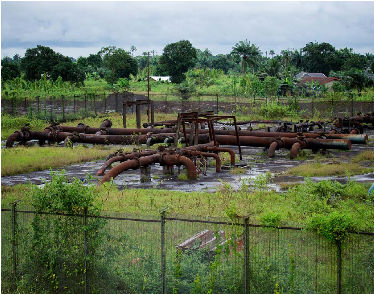
Shell's pipelines in Ogoniland are old and poorly maintained. There have been several spills and in 2009 there was a huge fire, at the Bomu Manifold, at K. Dere, Rivers state. September 2015, © Michael Uwemedimo/cmapping.net

“restore to as much as possible the original state of any impacted environment.” For all waters, “there shall be no visible oil sheen after the first 30 days;” for swamps, “there shall not be any sign of oil stain within the first 60 days.” The guidelines also stipulate that Shell should prevent spills from spreading into neighbouring land, waterways and groundwater. 17