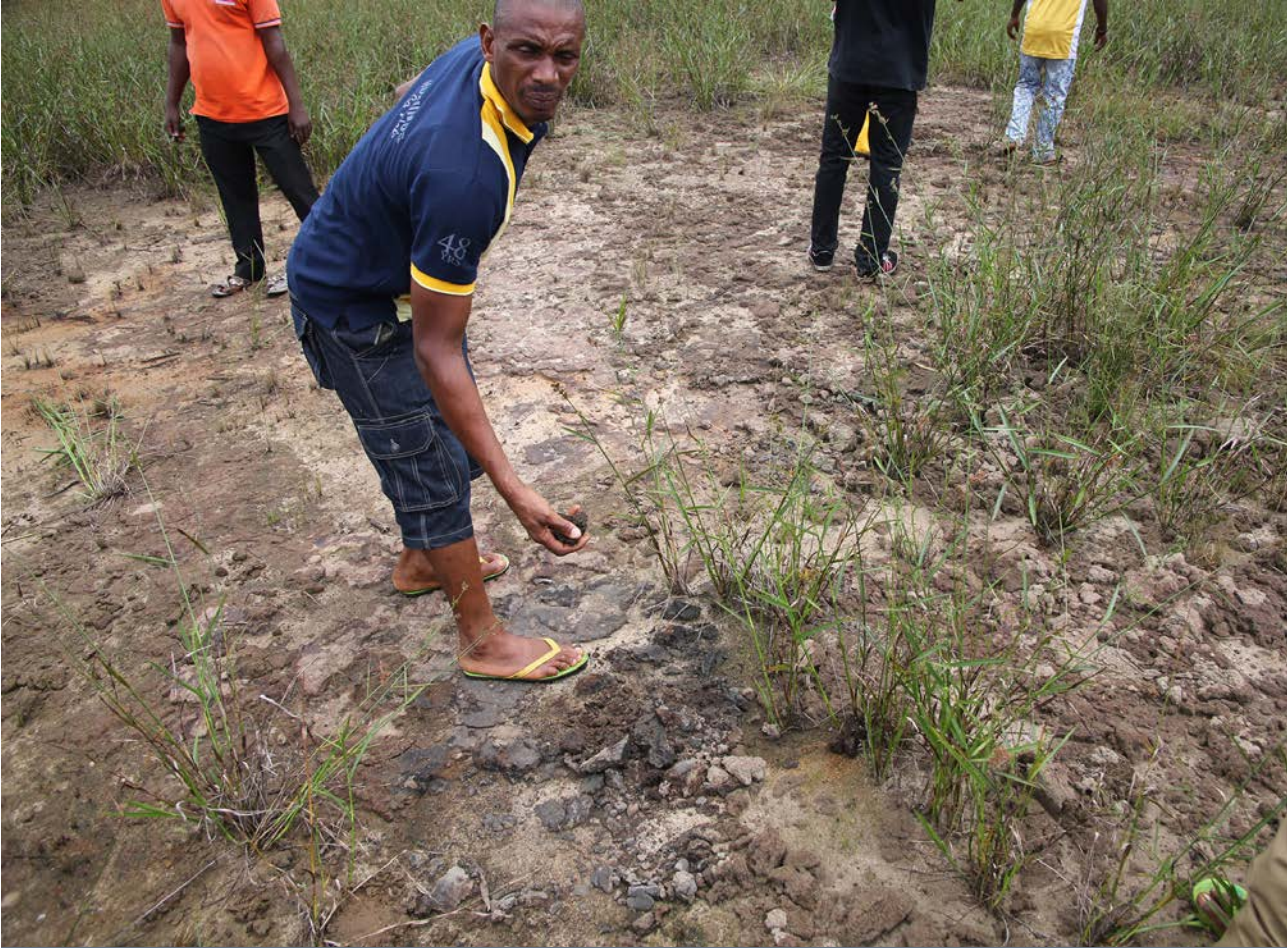
Area of oil contaminated soil, Boobanabe, August 2015

The pollution at Boobanabe dates back to 1970. A fire and spill at Shell's Bomu Well 11 led to severe and widespread damage to surrounding land, which was used by local people for farming and hunting. The company took several days to bring the fire under control. 113 UNEP's experts found that the soil and groundwater at the site were extremely contaminated, more than 40 years later. There were no spills between 1970 and UNEP's testing, it reported. 114 In August 2015, researchers from Amnesty International and CEHRD saw that pollution caused by this fire and spill was still visible. The area is still not being used for farming.