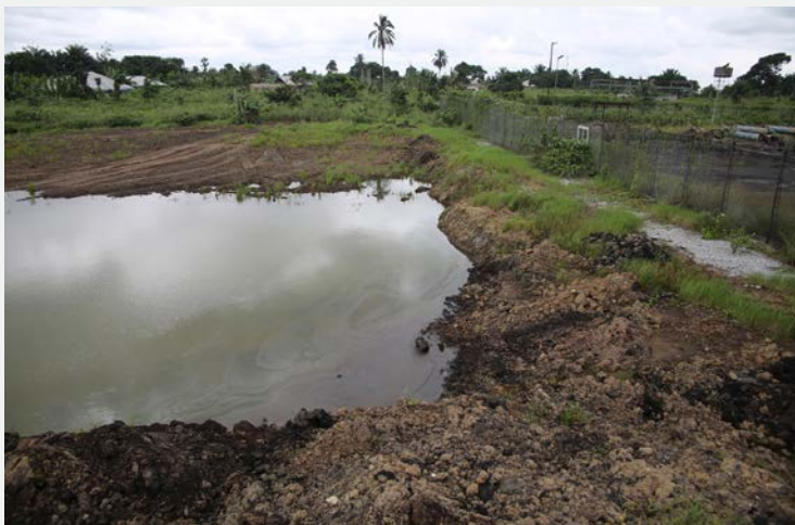
A large mound of blackened, contaminated soil, at the south side of the Bomu Manifold. Unprotected from the rain, it leaches oil into the pool. This polluted pool feeds a trench that leads towards the Barabeedom swamp. Researchers saw signs of contamination the length of the trench. August 2015