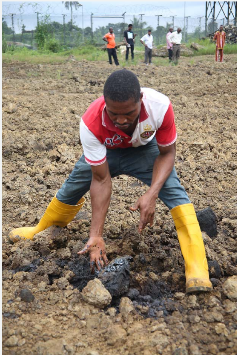
Shell claims that the area around the Bomu Manifold is clean, but the soil remains encrusted with oil. August 2015

Amnesty International wrote to Shell, asking it to provide details of its remediation attempts at Bomu, but the company did not provide any information. 77