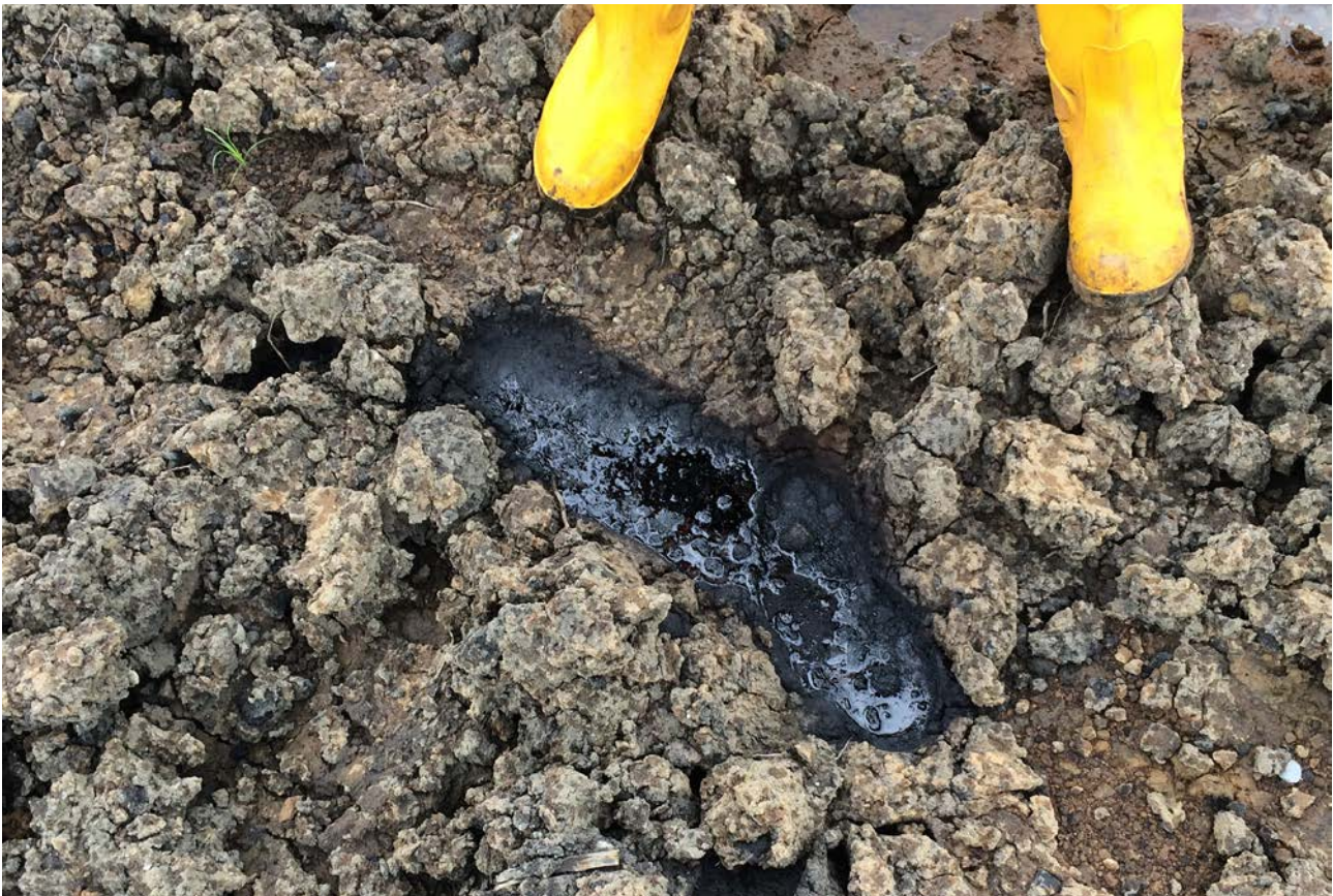
Oil contaminated land outside the Bomu Manifold

Amnesty International wrote to NOSDRA asking it to explain the basis for its certification of the remediation of the Bomu Manifold after the 2009 fire, but the agency did not provide information.