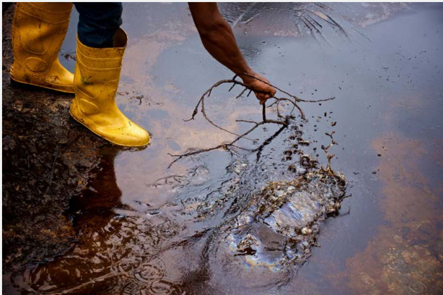
Oil contamination at Barabeedom swamp, K. Dere, September 2015

Amnesty International has written to Shell and NOSDRA asking to explain what measures have been taken to clean-up the oil pollution at Barabeedom swamp. Neither Shell nor NOSDRA provided any details.