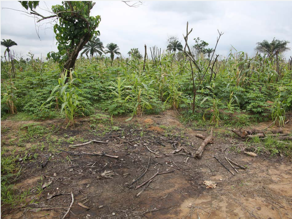
Oil has been left to soak into the ground next to a cassava field by the Shell pipeline at Okuluebu, Ogale. There is no sign of any attempt to clean it up. August 2015, © Amnesty International.