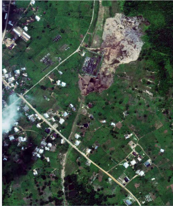
The Bomu Manifold, site of numerous oil spills and failed remediation attempts. Below the Kegbara Dere-Kpor road are the Barabeedom swamp and fishponds. Satellite image taken in 2015.

Pipes within the manifold were leaking oil when UNEP visited, and a trench leading south of the manifold towards a stream and the Barabeedom swamp was heavily contaminated with oil. 66