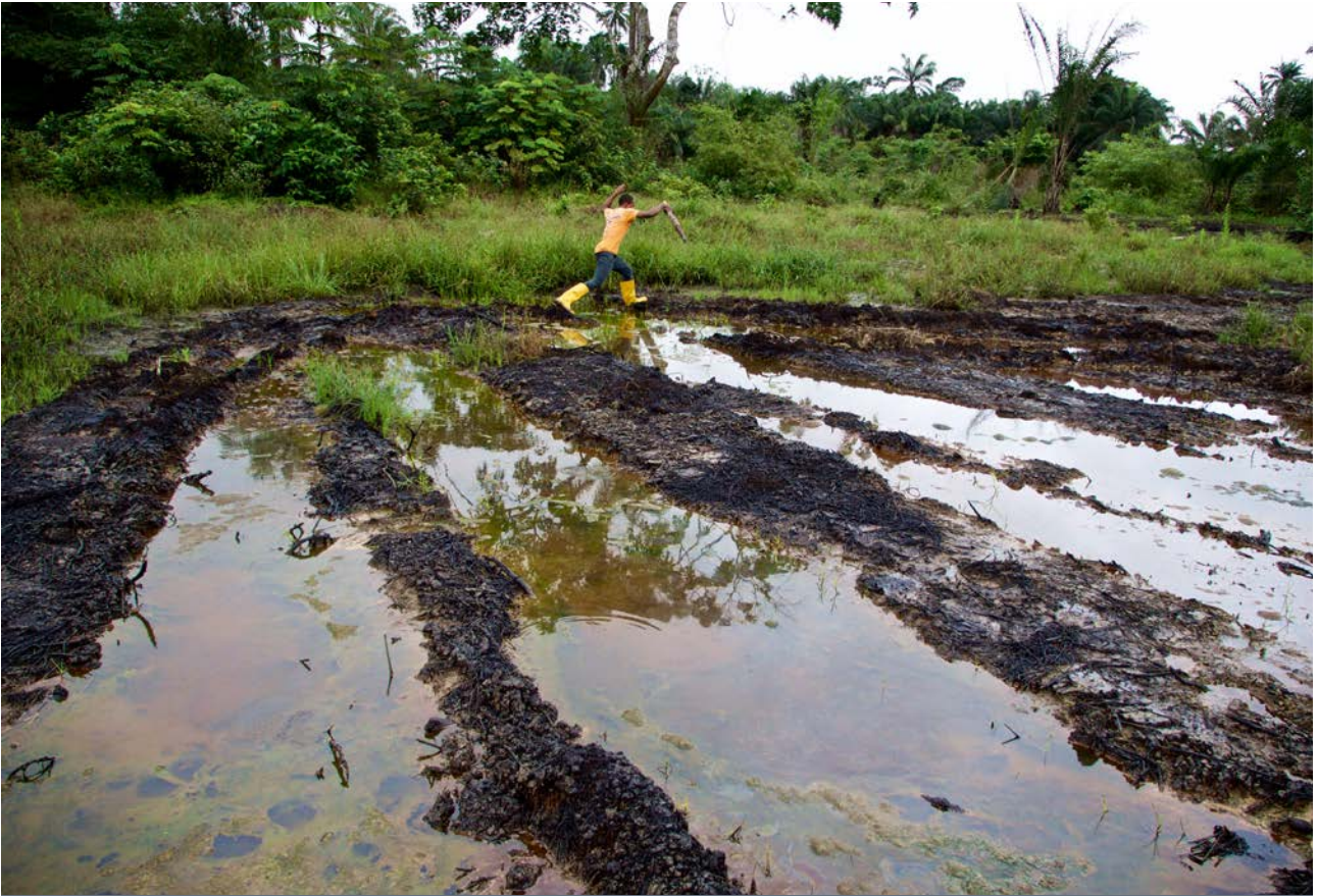
Contaminated waters at the Barabeedom swamp, September 2015."