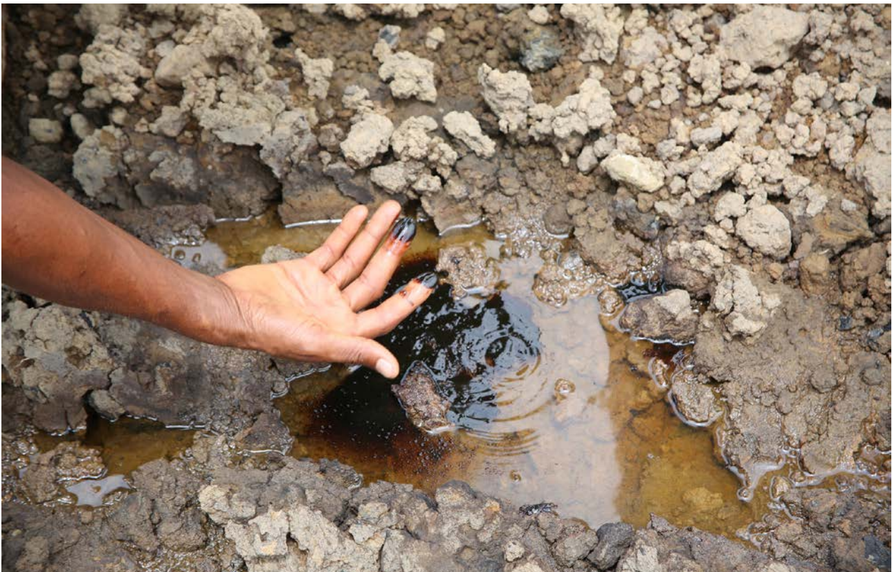
The land surrounding Shell pipelines at the Bomu Manifold, K. Dere is visibly contaminated with oil, despite attempts by the company to clean it up, August 2015, © Amnesty International

Additionally, the researchers mapped the spills that Shell reported had occurred close to each site since the UNEP report came out in 2011. This was done in order to check if it was possible that the company had remediated each site following UNEP's recommendations, but subsequent oil spills had then re-contaminated them.