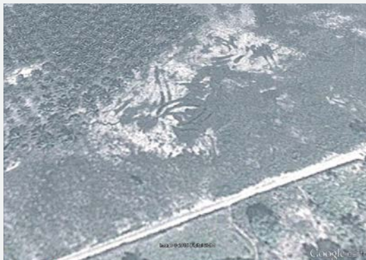
This image, taken in December 2013 shows vehicle tracks at Boobanabe, indicating that remediation activities were still taking place.

The court disagreed and ruled in the community’s favour, ordering Shell to compensate it for loss of income, valued at 4.6 million Naira (US$210,000). The company appealed the ruling, but in 1994 the Appeal Court affirmed the judgement of the lower court. 124