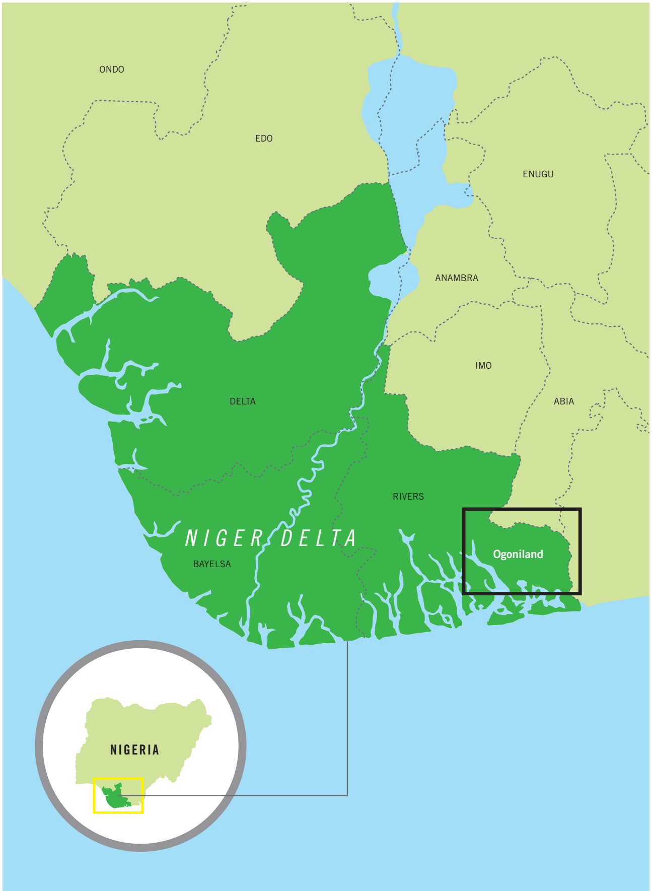
Map of the Niger Delta region in Nigeria