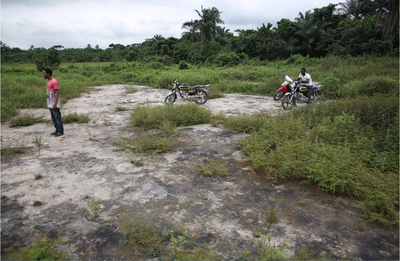
There is a strong smell of oil at Okuluebu where it has been left to soak into the ground, close to farmland and a stream. August 2015, © Amnesty International.

Okuluebu is an area of farmland, forest and swamp, about four kms north-east of Ocale town in Ogoniland. The swamp leads into a stream which flows down into the community. Pipelines belonging to Shell and the Nigerian National Petroleum Corporation (NNPC) run through the area in parallel. UNEP reported that a spill in 2009 had flowed more than 300m downhill from the Shell pipeline into the swamp at the head of the stream. There is a major risk therefore that the contamination spread downstream towards the community. 103