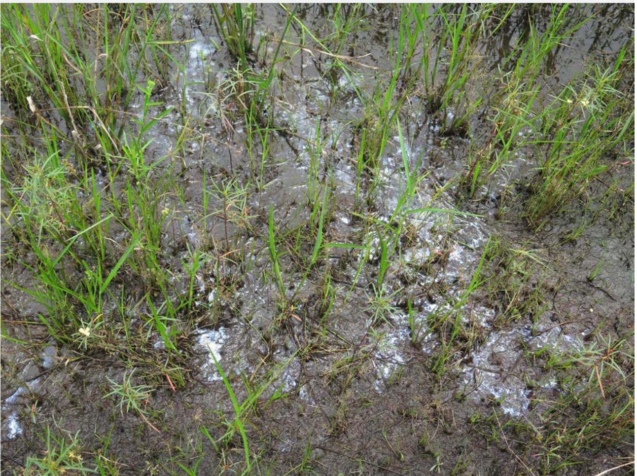
Oily sheen in the swamp at Boobanabe, August 2015. According to Nigerian government regulations, there should be no oil in water after 60 days. The spill at Boobanabe took place in 1970.

As with the other cases, Amnesty International has requested information from Shell and NOSDRA regarding this site, but did not receive any.