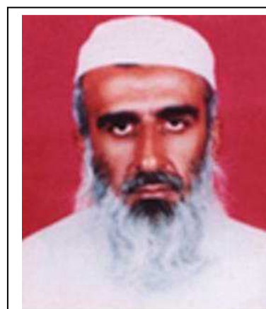
Molavi Ahmad Sayyad, found dead after being arrested by Iranian security forces in 1997

For many years, the east of the country has had a heavy military presence. This increased further after the “Tasuki incident” (see above). A small force known as Mersad (Ambush), which has reportedly been based in Kerman province since 1995 to counter drug-smuggling, 75 was expanded into a joint operational unit of various security forces with a base