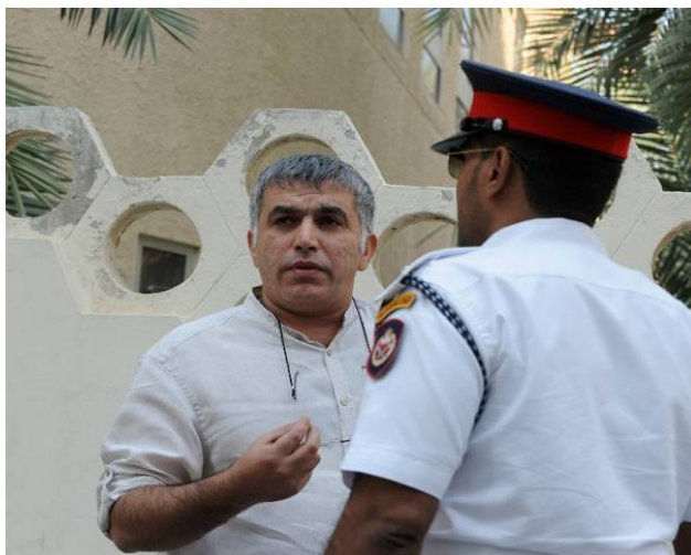
Human rights activist Nabeel Rajab

Human rights activists in Bahrain, in particular those who have exposed human rights violations and had contact with international human rights organizations, foreign journalists or international political figures, have faced harassment by the authorities including, in some cases, temporary travel bans. The government accuses them of being linked to political associations such as al-Haq and alleges that the information they present about Bahrain is exaggerated and negative.