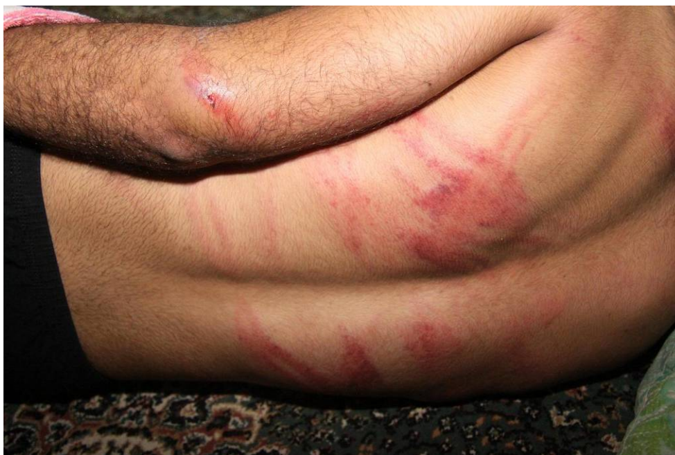
Marks of torture on the body of a Bahraini youth detained for a few hours in October 2010

In the past two years or so, allegations of torture and ill-treatment by Bahraini security forces have increased alarmingly. During 2010, many people, including juveniles, who were tried in connection with their alleged participation in riots and related violence, alleged that they were tortured or otherwise ill-treated to force them to sign confessions. These allegations seem generally to have been ignored by the government, which continues simply to deny that torture or other ill-treatment are used by the security forces. Allegations of torture and other ill-treatment made by the 23 people currently on trial have not been independently investigated.