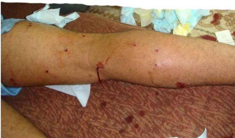
Marks of pellets shots on the leg of one of the four victims, October 2010