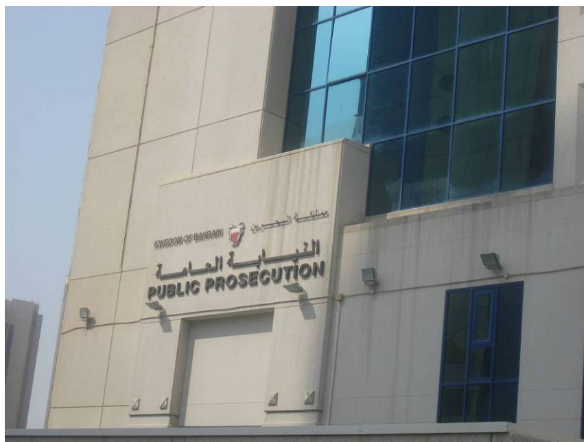
Public Prosecution building, Manama, October 2010

Testimony to the court of ‘Abdul-Ghani Khanjar, one of the 23 political opposition activists