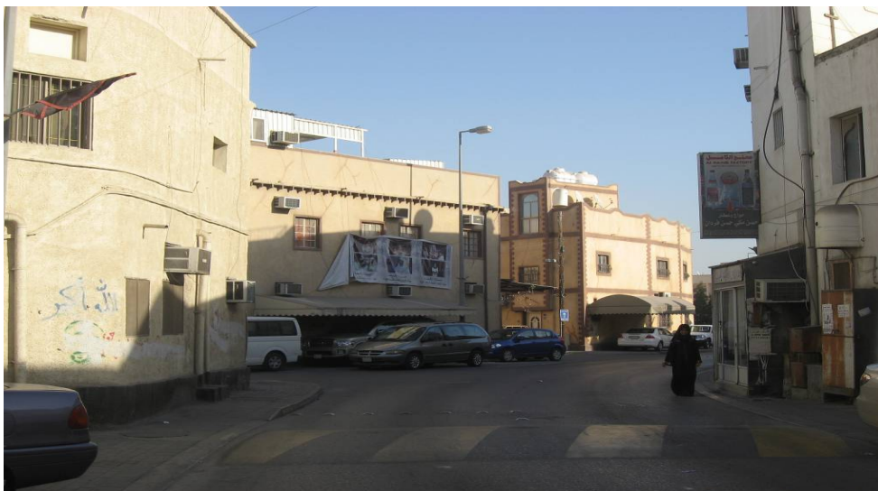
A village just outside Manama, October 2010

These advances, and others made soon after the present King replaced his father in 1999 and embarked on a much-needed process of reform, now appear to be in jeopardy. Bahrain has reached a crossroads in its human rights journey.