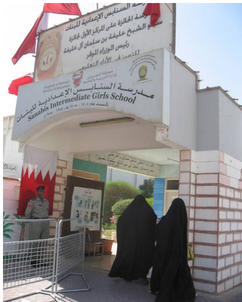
Women voting during the last parliamentary elections, Manama, October 2010