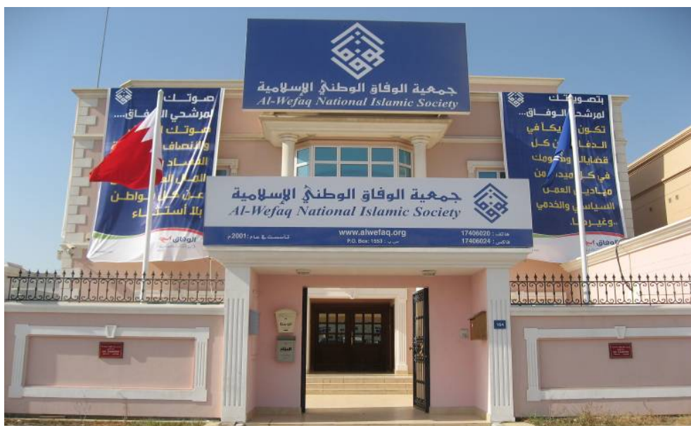
Front of the al-Wefaq party headquarters, Manama, October 2010

The reforms were based on a National Action Charter that Shaikh Hamad bin 'Issa Al Khalifa put forward to end the political turbulence of the 1990s and to establish a constitutional monarchy. 3 The Charter was overwhelmingly approved in a national referendum on 14 February 2001 and led in February 2002 to the adoption of a new and relatively progressive Constitution. The Constitution contains human rights guarantees and widened the suffrage to allow women to stand for public office and vote in elections. The State of Bahrain was renamed the Kingdom of Bahrain, and Shaikh Hamad bin 'Issa Al Khalifa assumed the throne as King.