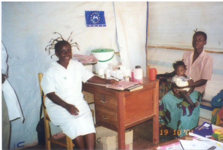
Maternal and child health clinic in Mwange Camp

Mwange camp is located in the Mporokoso District in the Northern Province near the border of northern Zambia. It is home to approximately 23,000 Congolese refugees since 1999.