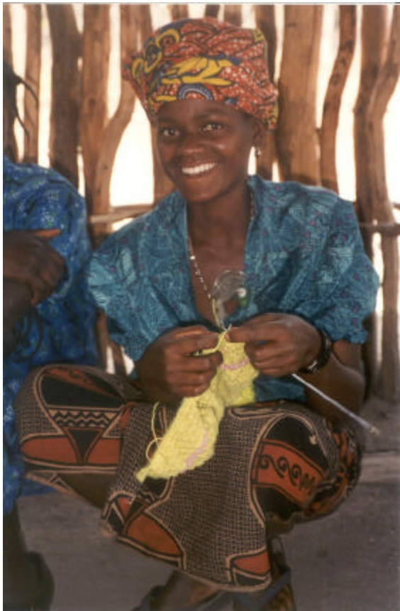
Angolan refugee participating in a women's craft club in Nangweshi camp.

Communication is one area in which reproductive health for refugees (RHR) programming could be strengthened. The team recognizes that this weakness could be a result of the renewed energy for RHR and that people and NGOs may not have caught up yet with the increase in information flow. The team would also like to emphasize that RH is an extremely broad area, with many new and challenging technical areas. Therefore, collaboration among partners is crucial to utilizing scarce resources efficiently and achieving improvements in the availability of reproductive health for refugees. The team would also like to note that there are differences between the camps in Zambia, which reflects good potential for sharing of expertise among camps. Although certain camps may have already addressed some of these suggestions, the team hopes that the recommendations from this assessment will highlight the most urgent needs to be addressed and offer an opportunity for increased technical support and guidance for all involved.