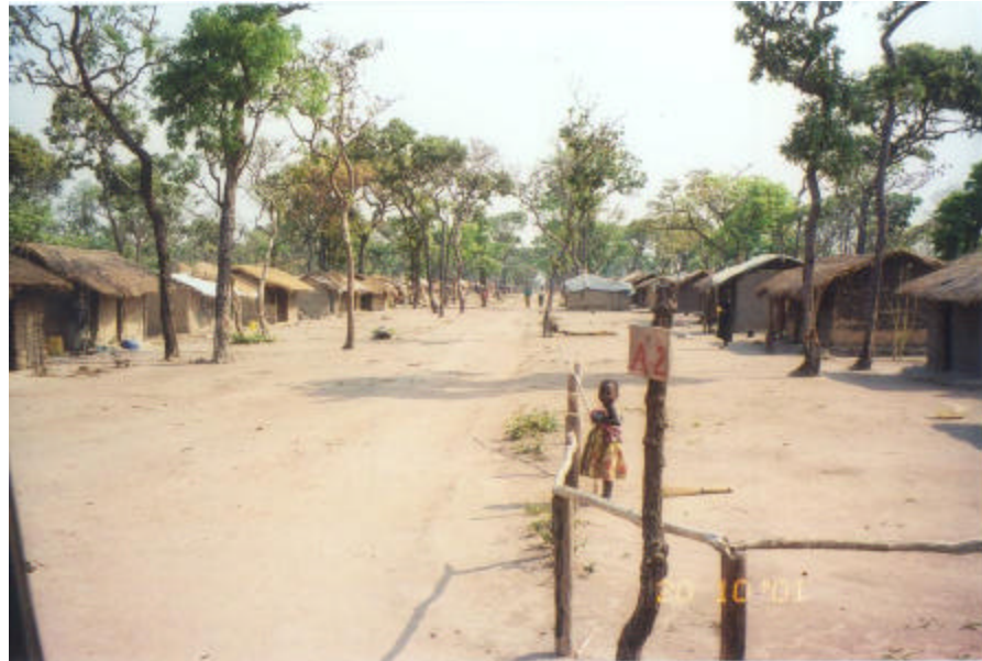
Kala Refugee Camp

Safe Motherhood Comprehensive ANC services (including syphilis testing) are provided and are well attended. In August 2001, 21 percent of syphilis tests were positive. Approximately 85 percent of deliveries are performed at the camp