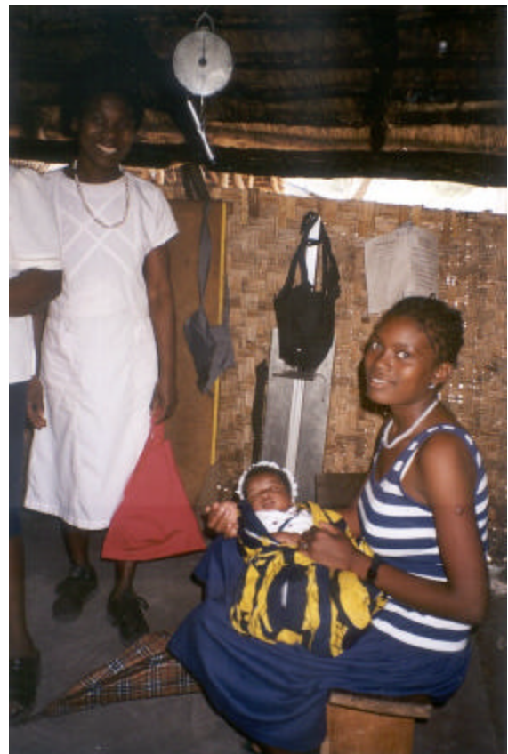
Maternal and child health clinic in Nangweshi Camp

When they do encounter a case, dilation and curettage is used due to a lack of manual vacuum aspiration supplies. The district hospital suffers from inadequate supplies, which could impact the quality of care of refugees referred for care. Transportation is a concern because the pontoon used to cross the Zambezi River is not available at night and transport during the rainy season is difficult. Pregnant women are not routinely tested for syphilis due to a lack of necessary materials. At present, only high-risk pregnant women are tested.