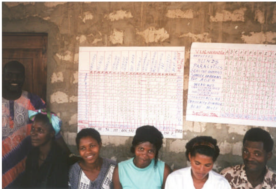
Community Development Workers in Nangweshi Camp shown with the charts they use to track camp residents.

In general, most refugees - with the exception of the urban/peri-urban refugee population, which suffers from transportation and communication barriers - have good access to safe motherhood services. The extent of unsafe abortion demands additional study. The availability of the Minimum Initial Services Package in transit centers and other areas where arriving refugees cross into the country was not investigated. Both of these areas require further exploration to determine the level of need. Supplies for syphilis testing of pregnant women are not consistently available.