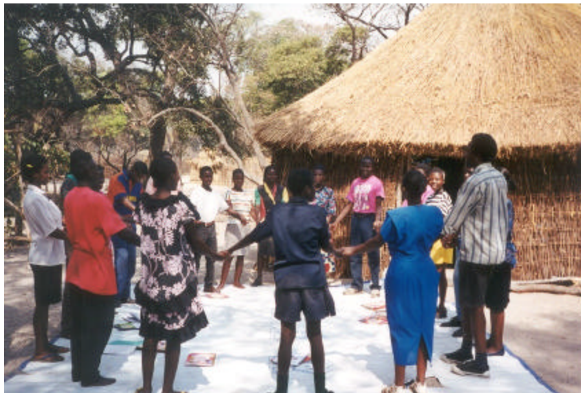
Peer education youth group in Nangweshi camp.

incidents are sometimes resolved by the victims' families forcing the perpetrator to marry the victim. Victim Support Units (VSU) are in place at camp police stations and some focus group participants acknowledged awareness of these services. However, it is not clear that the VSU staff are appropriately trained to serve victims of violence. CARE has recently been funded to implement GBV projects in Mwange and Nangweshi camps and part of their work will be to collaborate with the police department, provide necessary training, and strengthen the links between the refugees and VSUs so appropriate referrals can be made.