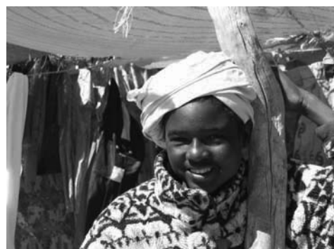
Market assessments are important to ensure that training opportunities lead to jobs.

Within the UN humanitarian coordination system, no specific working group or sector is responsible for vocational training and/or youth. 94 Instead, youth issues are often raised in protection and child protection working group meetings when discussion time has been requested. One international aid worker observed that these discussions often tend to focus on tensions caused by youth, rather than on proactive solutions to support them. 95 Many aid workers said they were overwhelmed by the number of working groups and coordinating bodies in Darfur and therefore prefer to incorporate vocational training and youth into existing working groups rather than create a new one. 96 However, no single group has taken on the responsibility for youth and vocational training issues and many of those interviewed indicated that attention to challenges facing young people and cross-organizational coordination is minimal.