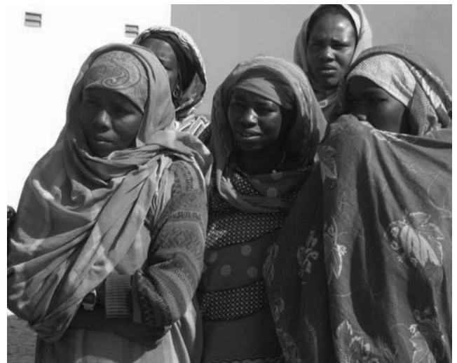
Girls often have the least access to services. Young people in camps and those who are disabled are especially likely to be overlooked.

There also appear to be very few services targeted at youth with disabilities despite the challenges they face. Those that do exist are insufficient; for example, the United