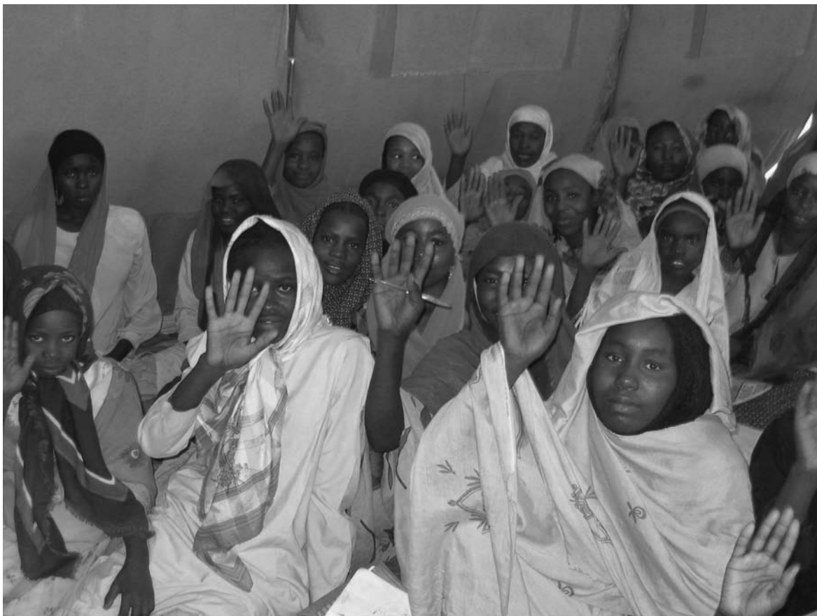
While these Darfuri girls are attending school in refugee camps in Chad, few of those displaced within Darfur have similar opportunities.

Despite these challenges, information gathered highlighted how many young people continue to contribute to the welfare of their communities, such as volunteering to teach younger children and leading information campaigns.