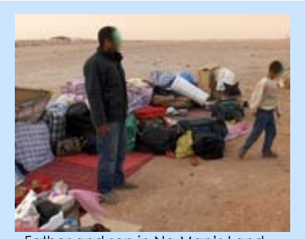
Father and son in No Man's Land

A final template for the IDP Intentions Survey, which will reach some 8,000 families throughout Iraq, was agreed upon by all concerned parties and progress was made on the Survey's statistical methods. Partners for survey implementation were selected for the South and Centre. Selection for the three northern Governorates will be completed shortly; training of survey monitors will begin in April.