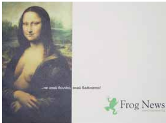
Fresco in the lobby of the Frog News office