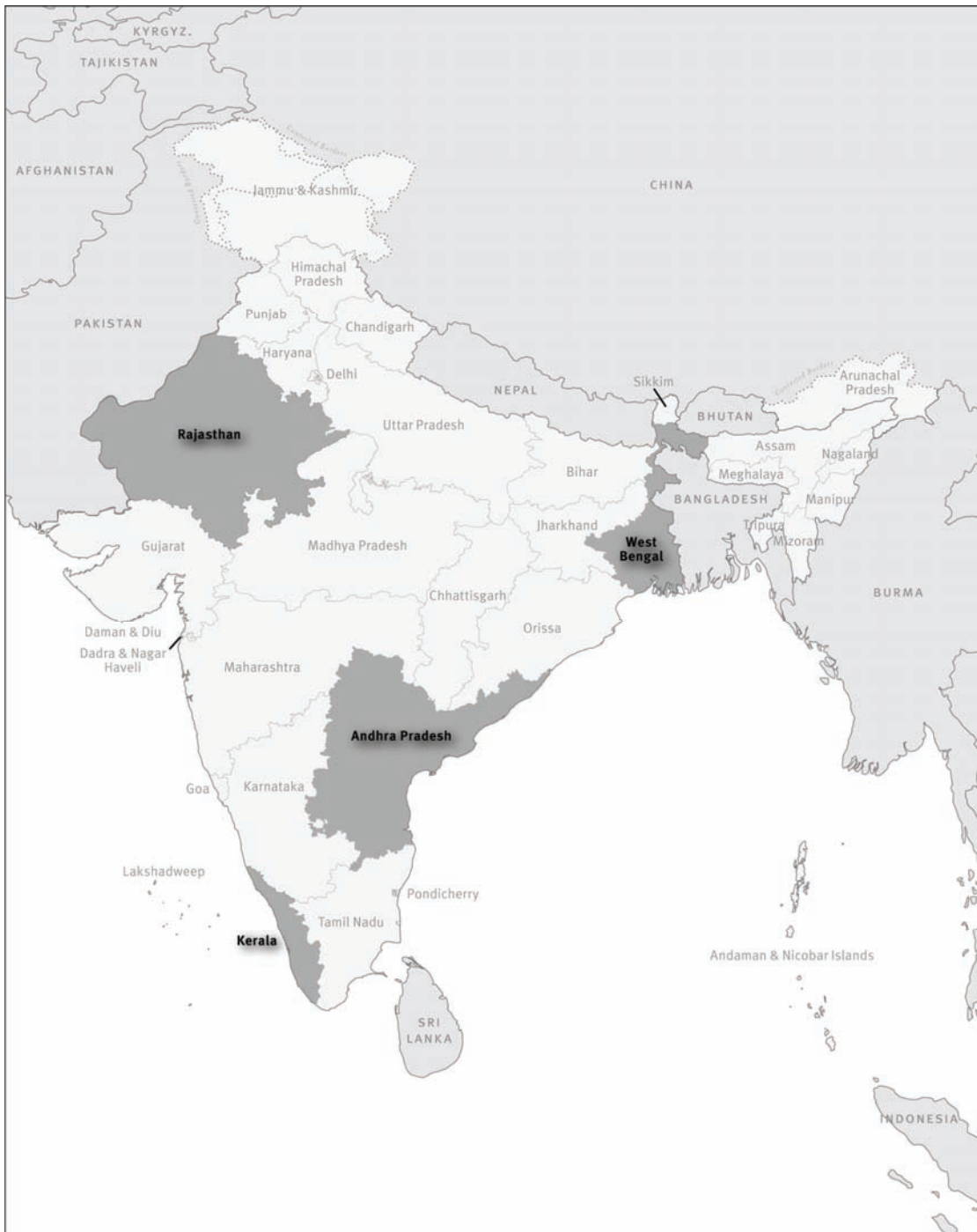
Map 1: States in which Human Rights Watch conducted field research on palliative care