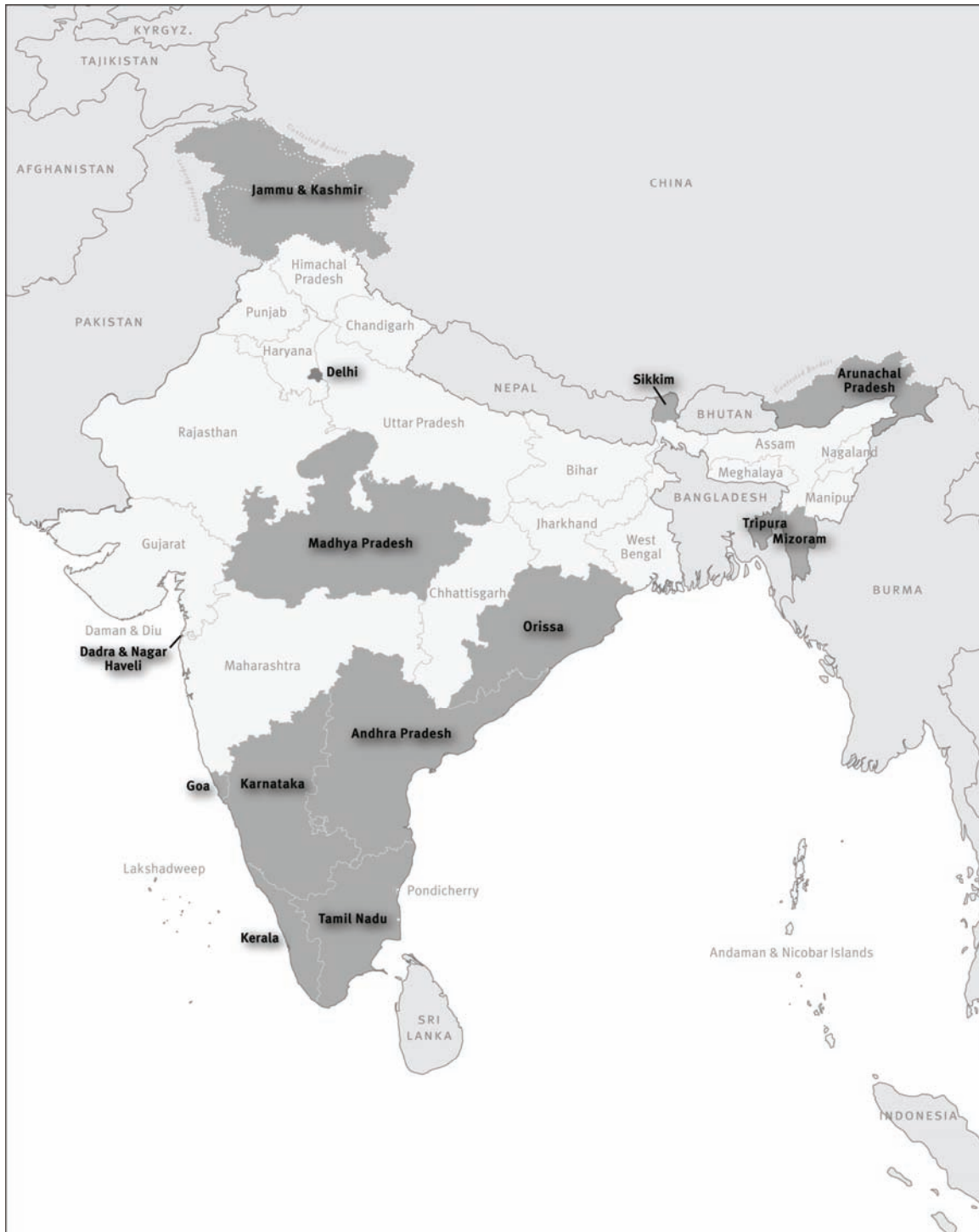
Map 2: States and Union Territories that have adopted the model rule