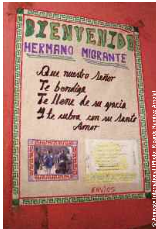
A poster welcomes migrants at one of the migrants' shelters run by the Catholic Church, Tierra Blanca, Veracruz state.

Long-standing concerns have been raised by NGOs, the Inter-American Commission of Human Rights and UN thematic mechanisms about human rights abuses against migrants in detention, the denial of labour rights to migrant workers, and shortcomings in the migration and asylum determination process. However, this report focuses specifically on abuses against migrants largely by criminal gangs who are frequently assisted, either directly or by omission, at some level by public officials. These abuses, although widespread, are almost never reported. The report focuses on the failure of the state to ensure effective prevention, detection, investigation, punishment and redress for these abuses, thereby creating a climate of neglect and impunity. It ends with a series of recommendations to the authorities to comply with their international responsibilities in order to ensure respect, protection and fulfilment of the rights of irregular migrants in transit in Mexico.