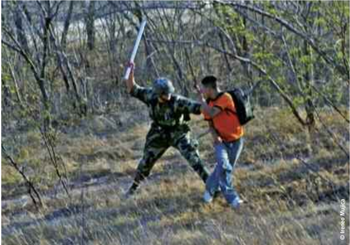
A member of the Mexican Navy wields a baton during an assault on migrants near Las Palmas in Niltonpec municipality, Oaxaca state, 31 March 2008.

how one migrant fled and was chased by an INM official holding a short baton that he placed on the man's neck. Villagers said the man was convulsed by an electric current and fell dazed to the floor. He was then forced to his feet and taken away by the INM agents. The man may already have been effectively in custody when the stun baton was applied and posed no threat to the officials or to bystanders. 38 When villagers complained about the treatment of the migrants, INM officials threatened to arrest one woman for people smuggling because of the humanitarian assistance she and others provided for migrants. CNDH officials arrived the following day to investigate; their findings have yet to be published. The INM has consistently denied that its agents use electric shock batons in any circumstances.