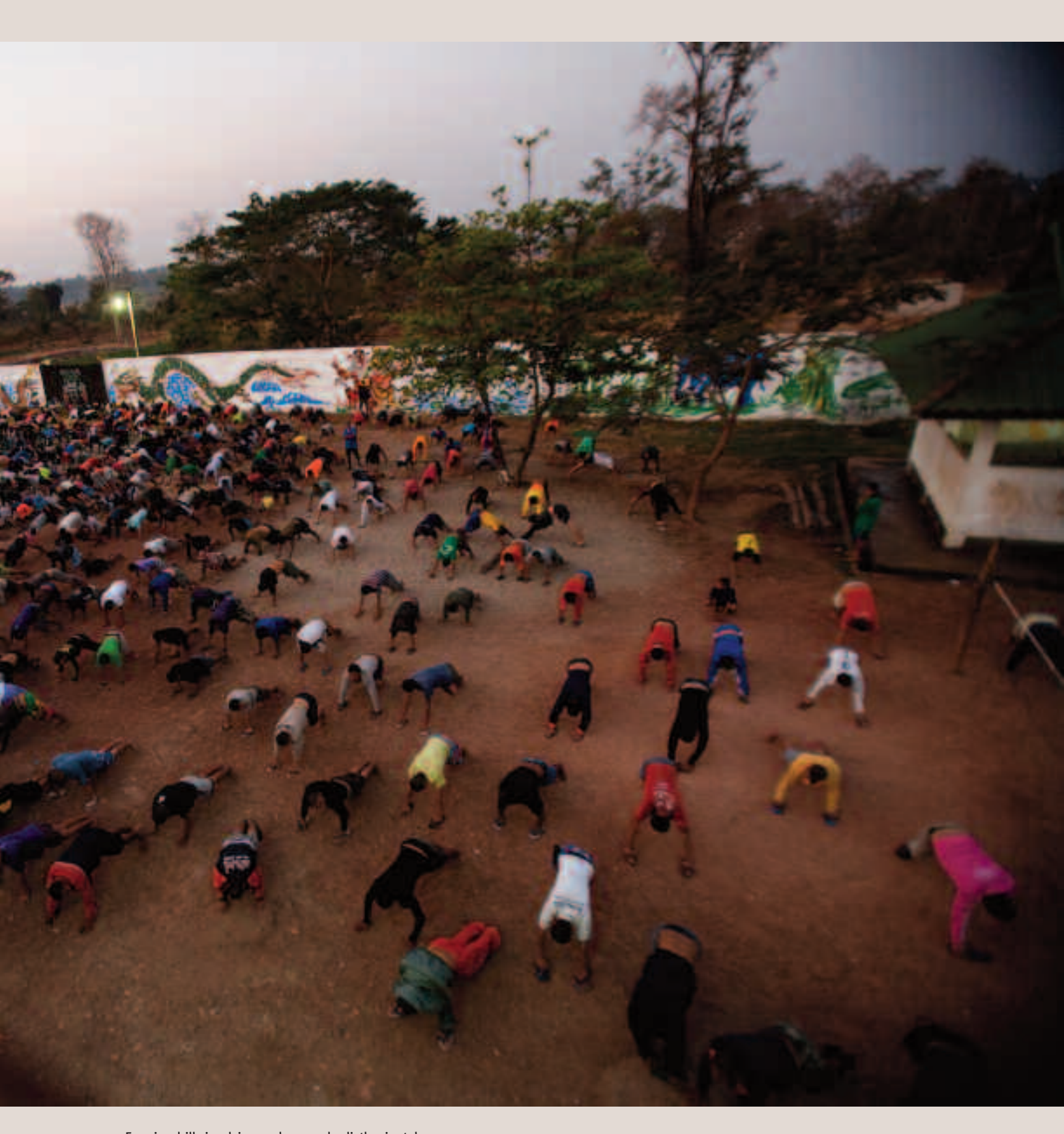
Exercise drills involving pushups and calisthenics take place early every morning in Somsanga center.