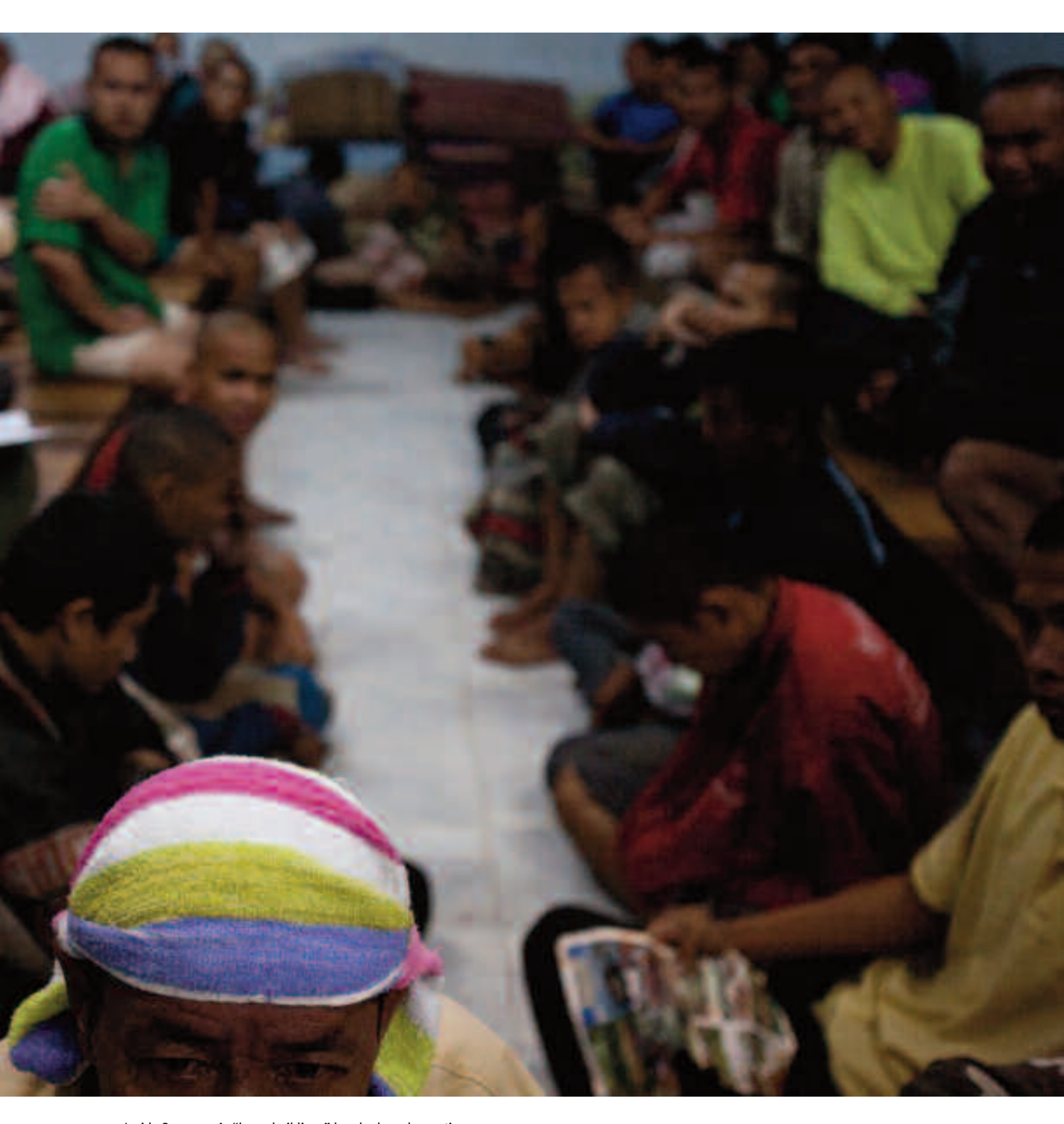
Inside Somsanga's "lower buildings" hundreds and sometimes over a thousand detainees languish in overcrowded cells. People who might have a genuine need for drug dependency treatment are locked in alongside casual drug users, beggars, the homeless, the mentally ill, and street children.