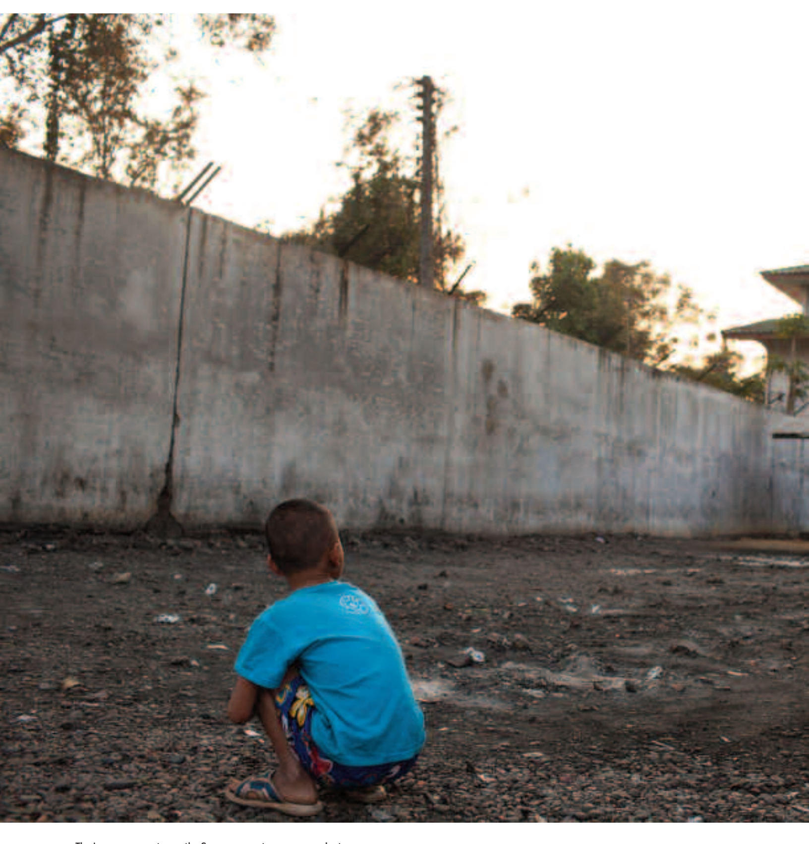
The Lao government uses the Somsanga center as a convenient dumping ground for populations that are deemed "undesirable" by police or the village militia. In addition to the mentally ill, homeless people and street children may be detained in Somsanga.