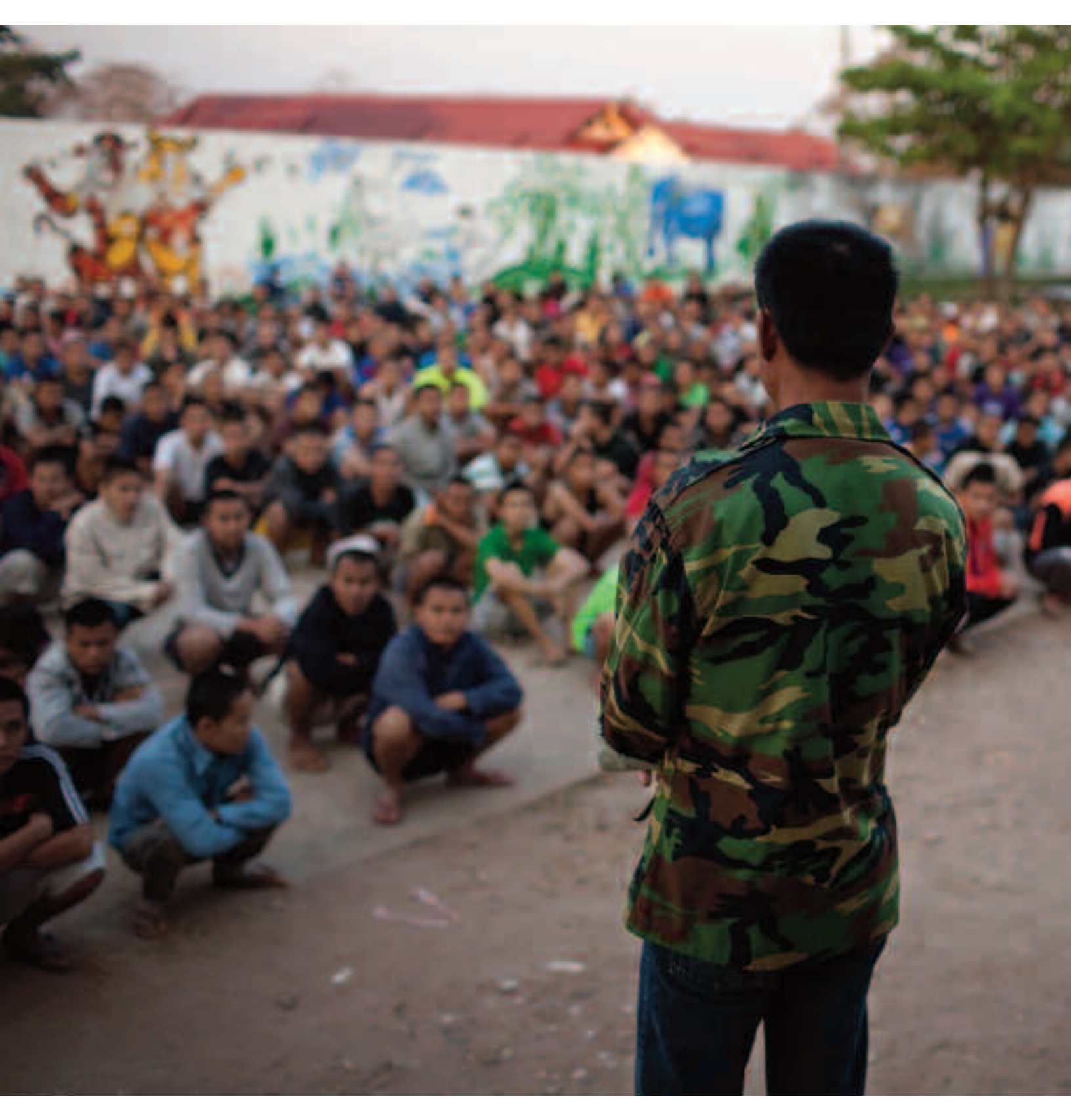
A guard lectures detainees in Somsanga center. Classes in drug use and courses such as vocational training may be beneficial for some people trying to overcome drug dependency, but there is no rationale for premising such services on months or years of involuntary detention.