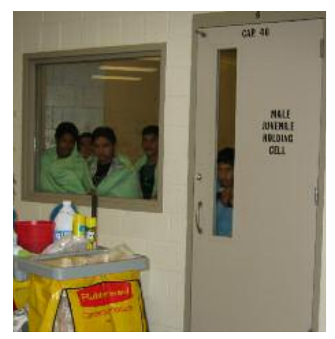
Boys held in a cell at the Border Patrol's Fort Brown (Texas) station.

inal backgrounds that would justify ICE's retention of custody over these children.<sup>45</sup> Custody of unaccompanied children with criminal convictions was further clarified by the TVPRA, which provides that unaccompanied children charged with having committed a criminal offense should be in DUCS custody, and may be placed in a secure DUCS facility.