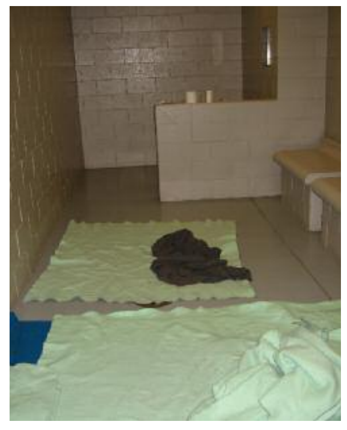
Children held at the Fort Brown Border Patrol facility sleep on cold floors, with minimal bedding.

There are no appropriate sleeping accommodations for children in Border Patrol stations. Like adults, children sleep on cold floors, thin mats, plastic sheets, cement benches, newspaper or plastic "boat beds." At El Paso and Ft. Brown, most children are provided with blankets, but at the Harlingen substation children received no blankets at all. When we asked why they had none, agents told us that the station used to provide them, but that the blankets became infested with bugs because the children were so dirty. The blankets were discarded. Children at stations where blankets are provided confirmed that the blankets were dirty; one child stated that she did not use the blanket she was given because it had bugs on it. 65