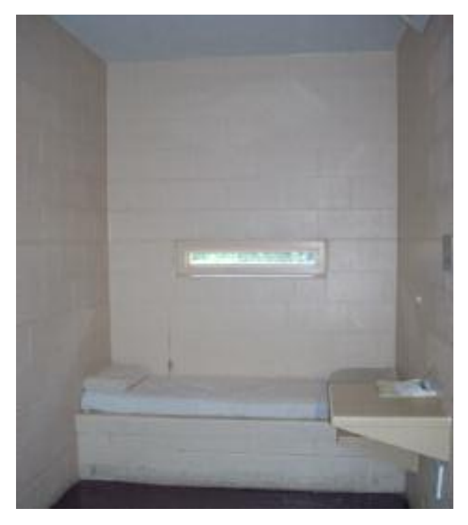
A bedroom at the Southwest Indiana Regional Youth Village (Vincennes), Indiana, is reminiscent of a prison cell.

The problem of institutional facilities and their impact on safety and care is particularly pronounced in staff-secure and secure facilities. (See Appendix F for definition of secure and staff-secure facilities.) In the year we conducted most of our field research, 108 DUCS opened new secure and staff-secure facilities. In part this was a response to the growing number of children referred to DHS from law enforcement.<sup>109</sup> However, DUCS increasingly places children with behavioral and mental health problems in staff-secure and secure facilities, rather than therapeutic programs. Many of these facilities do not yet have adequate staffing in place to handle the increased population, prompting concerns from staff and attorneys about the facilities' ability to meet the complex needs of the children.<sup>110</sup> At the time of our visit to the Northern Virginia Juvenile Detention Home (NOVA) in Alexandria, Virginia, the facility had no daily staff members on site who were trained in DUCS policies and procedures. 111 Rapid population growth seems to have contributed to abuses that developed at both the Away From Home Texas