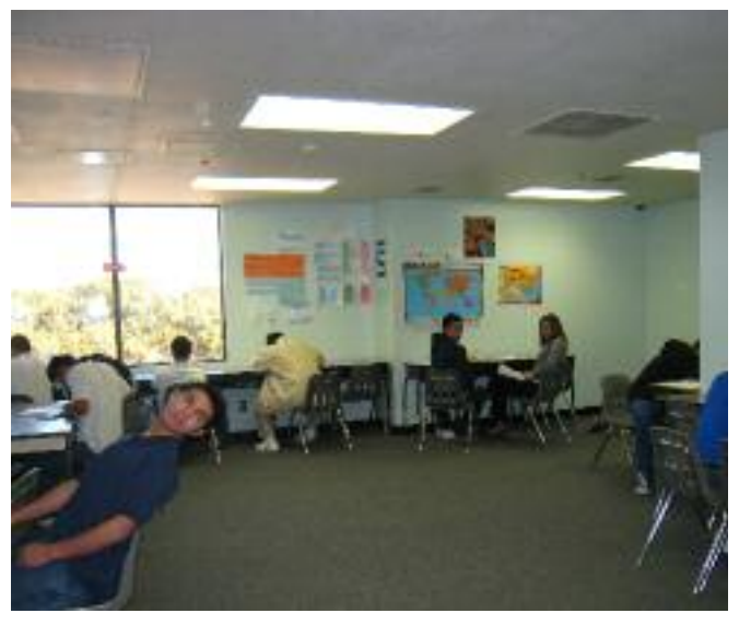
The quality—and quantity—of education varies between DUCS program sites. Here, children study at the Abraxas Hector Garza Center in San Antonio, Texas.

training or vocational training. Many of the children expressed a desire for more English language instruction. In addition, most facilities lacked age-appropriate books or magazines for children in their native languages.