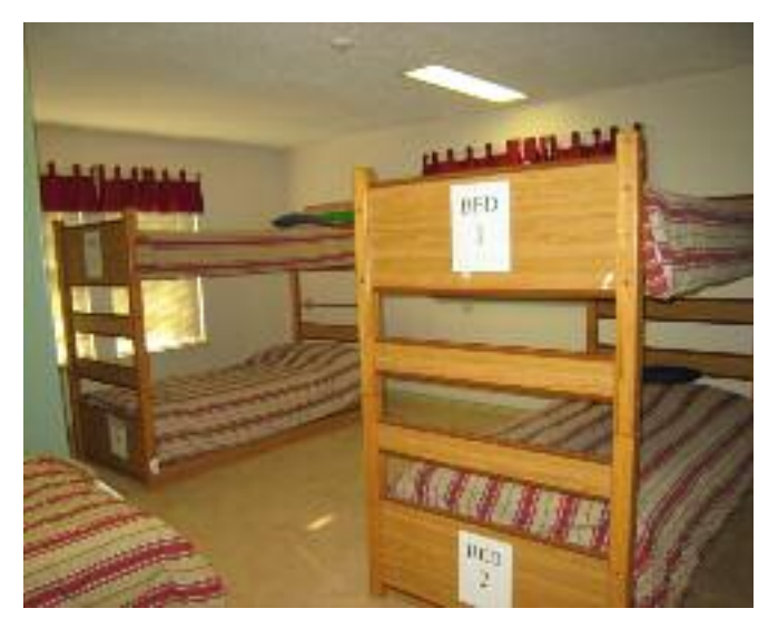
A bedroom at the Baptist Child and Family Services (BCFS) shelter, an ORR facility, in San Antonio, Texas, has a more dorm-like feel.

DUCS uses a range of facilities from foster care, to group homes, shelters, staff-secure and secure facilities for the placement of children. (See Appendix F for additional information.) While DUCS has expanded the use of foster care and decreased the use of secure facilities (discontinuing agreements with 31 securef acilities used by the former INS),133 a lack of clarity and consistency in placement decisions has sometimes resulted in an overuse of staff-secure and secure facilities. Some staff-secure and, particularly, secure facilities are, or closely resemble, juvenile correctional facilities, and are characterized by constant observation from staff and increased structural security. Staff-secure and secure facilities are wholly inappropriate for most<sup>134</sup> unaccompanied children because they are based on a correctional, not a child-welfare, service model and feature a high degree of institutionalization. However