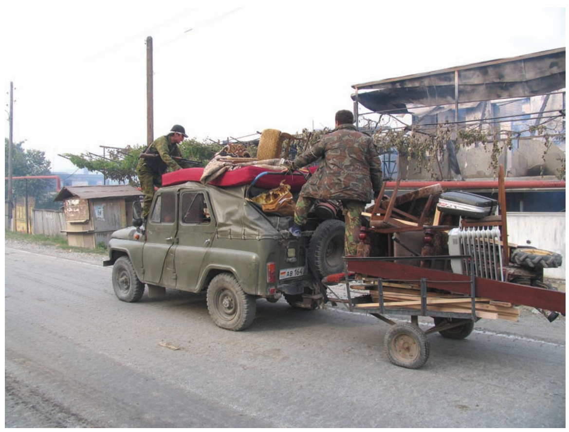
Armed looters take household items from the ethnic Georgian village of Kvemo Achabeti.

On August 12, Human Rights Watch researchers traveling on the TransCam road from Java to Tskhinvali witnessed terrifying scenes of destruction in Kekhvi, Kurta, Zemo Achabeti, Kvemo Achabeti, and Tamarasheni. Dozens of houses had been freshly burned down and remnants of houses and household items were still smoldering. Many other houses were aflame and appeared to have been just torched. Human Rights Watch also saw and photographed Ossetian militias as they moved along the road next to Russian tanks and armored personnel carriers, entered the houses that remained intact, and loaded furniture, rugs, televisions, and other valuables onto their vehicles. Attempting to justify the looters' actions, an Ossetian man traveling on the same road told Human Rights Watch, "Of course, they are entitled to take things from Georgians now—because they lost their own property in Tskhinvali and other places."<sup>362</sup>