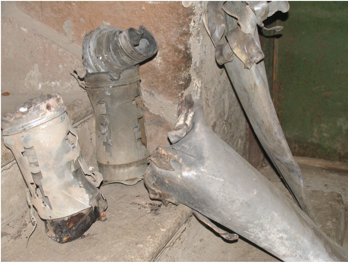
Components of BM-21 Grad rockets recovered in an apartment building in Tskhinvali.

The above are only a few of the examples of damage caused to the South Ossetian capital by Grad attacks.