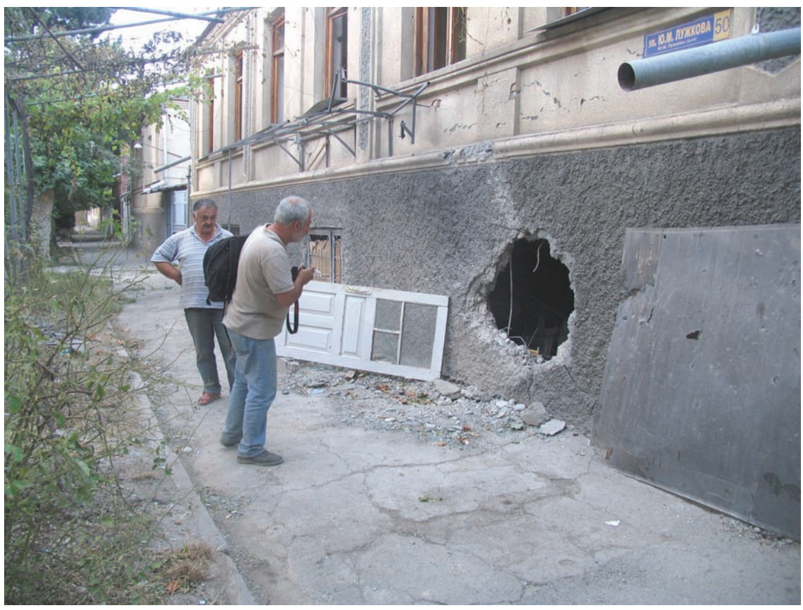
Human Rights Watch examining the basement of an apartment building on Luzhkov Street, in Tskhinvali, which was hit by Georgian tank fire.

Human Rights Watch researchers saw multiple apartment buildings in Tskhinvali hit by tank fire. In some cases, it was clear that the tanks and infantry fighting vehicles fired at close range into basements of buildings. Human Rights Watch interviewed several people who were sheltering in these basements at the time of the attack.