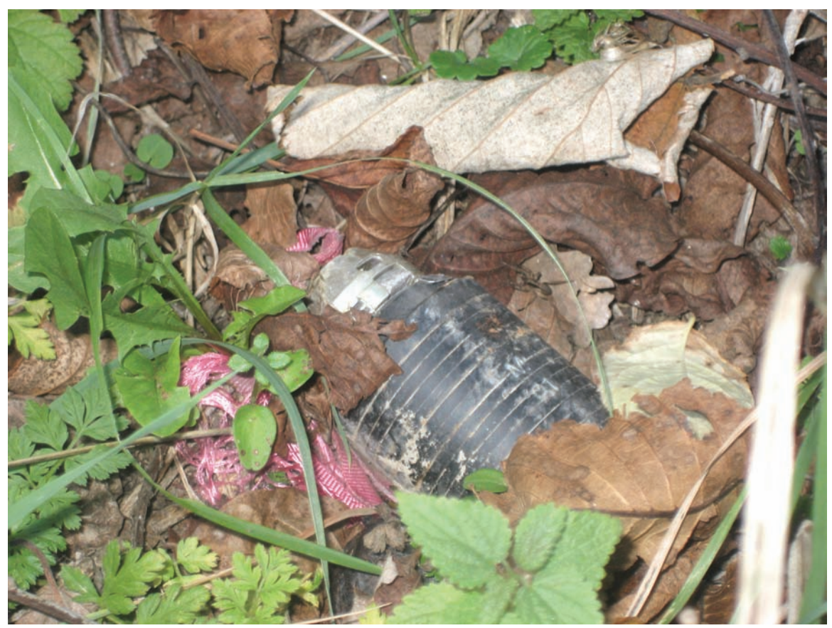
An unexploded M85, an anti-personnel and anti-armor submunition found in Shindisi in October 2008. M85s caused civilian deaths and injuries in Shindisi both at the time of attack and afterwards. Bought from Israel and launched by Georgia, this submunition is carried in an Mk-4 160 mm rocket.

which they brought back to the village. When they tried to disassemble it the submunition exploded, killing Ramaz Arabashvili, age around 40, and wounding four others.<sup>182</sup>