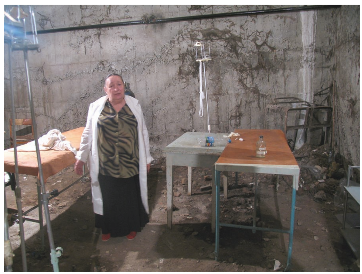
A doctor in the basement of the Tskhinvali hospital where, despite poor lighting and inadequate equipment, medical personnel managed to save, during the fighting, all 273 of their wounded patients.

Hospitals enjoy a status of special protection under humanitarian law beyond their immunity as civilian objects, and the presence of wounded combatants there does not turn them into legitimate targets.<sup>125</sup>