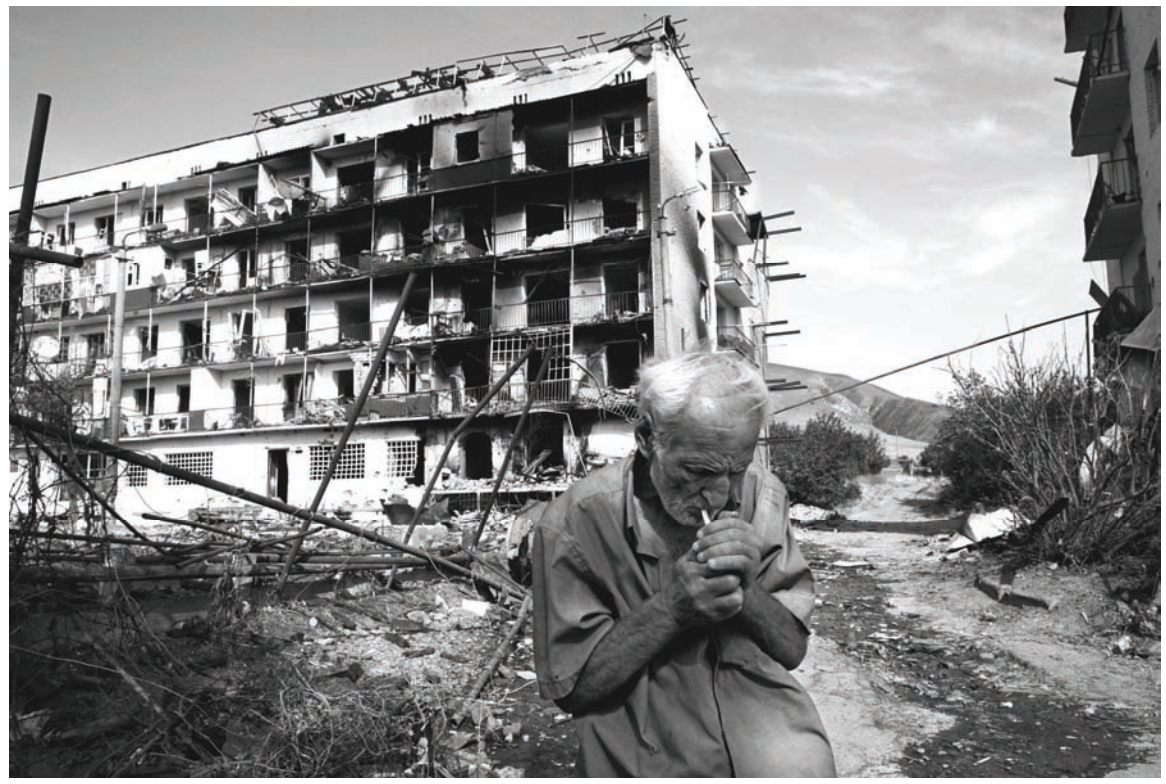
A man stands in front of an apartment building on Sukhishvili Street in Gori, bombed by Russian forces prior to their advance into Gori district.

In some cases in South Ossetia, civilian casualties and damage to civilian property in Georgian villages were caused by artillery shelling. Because both Russian and South Ossetian forces possessed artillery capacity, Human Rights Watch was not always able to establish with certainty whether responsibility for indiscriminate artillery attacks lay with Russian or South Ossetian forces. In these cases further investigation is required to determine specific responsibility for violations of international humanitarian law.