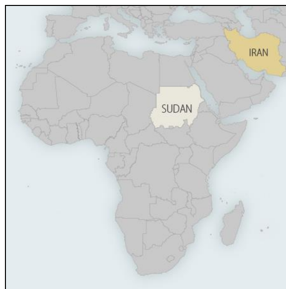
Figure 5. Sudan

The overwhelming majority of Muslims in Africa are Sunni, and Muslim-inhabited African countries have tended to be responsive to financial and diplomatic overtures from Iran's rival, Saudi Arabia. Amid the Saudi-Iran dispute in January 2016 over the Nimr execution, several African countries broke relations with Iran outright, including Djibouti, Comoros, and Somalia,