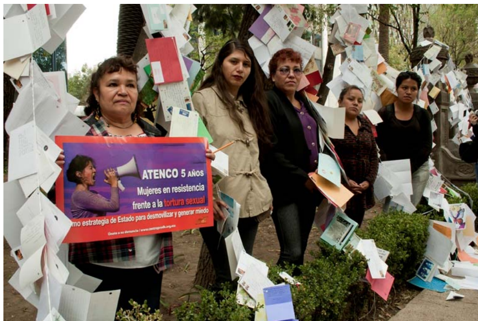
The women of Atenco demanding justice during a demonstration

The National Human Rights Commission (Comisión Nacional de Derechos Humanos, CNDH) and National Supreme Court of Justice (Suprema Corte de Justicia de la Nación, SCJN) both carried out enquiries and concluded that grave human rights violations had been committed, including discrimination and torture involving sexual violence against women detainees, and issued recommendations for perpetrators to be brought to justice and victims to receive reparations. Nevertheless, state and federal authorities have failed to comply despite accepting the recommendations in principle. Neither the CNDH nor the SCJN carried out an evaluation of compliance. In the face of this evident failure to ensure access to justice for victims, eleven of the women have taken their case to the Inter American Commission of Human Rights, which has formally admitted the case. 29