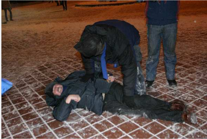
Andrei Sannikau lying injured before the attempt to drive him to hospital

news website. In 2010 he announced his intention to run in the presidential elections. He was on the square on 19 December and was injured when police broke up the demonstration. According to eyewitnesses, he was assaulted by police who pinned him down with a riot shield and repeatedly jumped onto it, severely injuring his legs. With the help of friends and his wife he was able to flee and was being driven to hospital, when the car was stopped by police and Andrei Sannikau was reportedly dragged out of the car and arrested. His wife, the independent journalist Iryna Khalip, who was travelling in the car with him, was punched in the face and arrested. She was speaking to the Russian Radio station Ekho Moskvyy as they were stopped by police and described what was happening live on air.