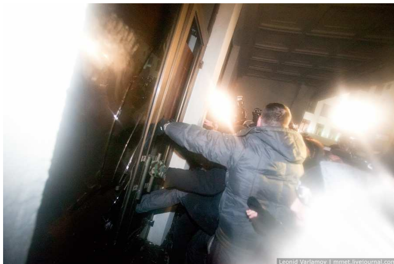
Unknown men attempt to break into Government Building

As outlined above, the demonstration was peaceful except for a small group of men at the back of the crowd who tried to break into Government Building. Eye witnesses have reported to Amnesty International that apart from the small group of men at the back of the crowd they did not see anybody carrying weapons or offensive articles of any kind. However, films shown on state television have shown scenes of the square after the demonstration littered with sticks, shovels and axes. Eyewitnesses claim that these items were deliberately planted by the security forces in order to incriminate the demonstrators.