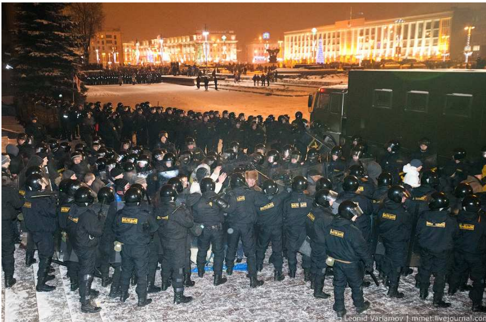
Law enforcement officers forming a corridor and beating demonstrators as they pass through to the police van