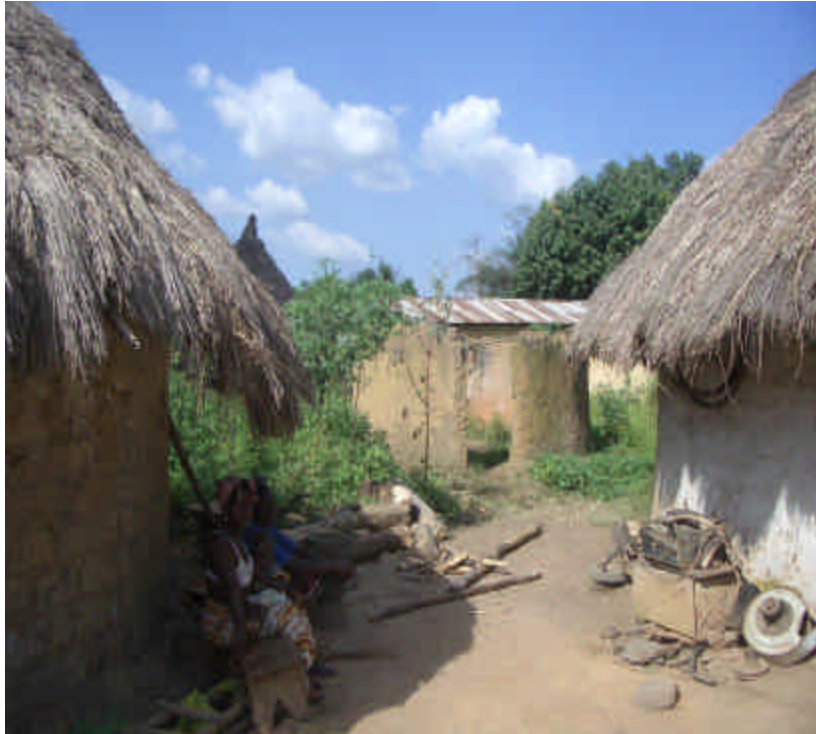
House destroyed during the attacks in Guéckédou prefecture (Photo: Mpako Foaleng/Global IDP Project, November 2004)

Displacement in Guinea was mainly caused by multiple incursions of armed groups from Sierra Leone and Liberia, and fierce clashes between these groups and the Guinean army. As a result of the fighting many towns and villages in the border areas were destroyed, looted and burned. Pamelap on the border with Sierra Leone and in particular the Parrot's Beak located south-west of Guéckédou have faced several incidents of attacks that led to the massive displacement of local residents and refugees sheltering in camps.