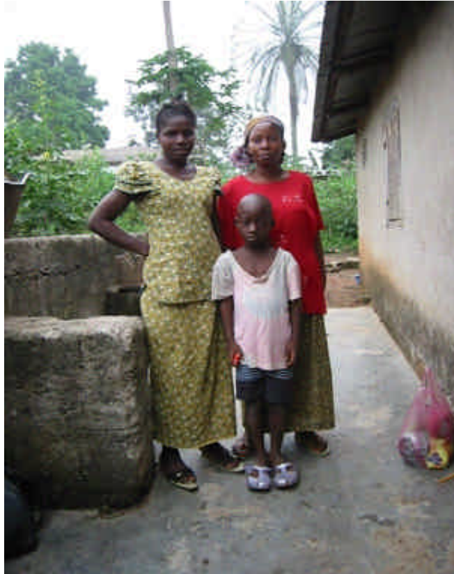
IDPs in N'Zérékoré still hoping to return to Guéckédou

As the wars in Sierra Leone and Liberia, the crisis in Côte d'Ivoire that broke out in September 2002 also resulted in an influx of Guinean returnees. The returnees, who had migrated to neighbouring countries for economic, political and other reasons over the past decades, often arrive by the same means and in the same condition as refugees. The stream of returnees continued during 2003 and – albeit at a lower level – in 2004. In 2002 alone, some 48,000 Guinean returnees were registered in Guinea Forestière and Haute Guinea. The entry points for these groups were the prefectures of Lola, Beyla Yomou and N'Zérékoré. Another 50,000-150,000 Guinean returnees are reportedly spread out in the main