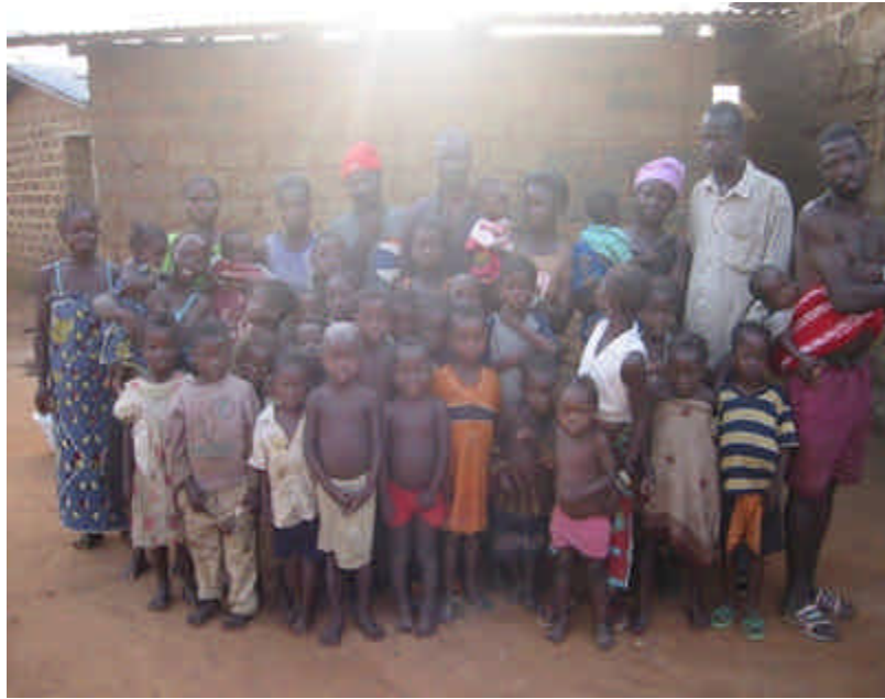
Guinean families who returned from Liberia and Côte d'Ivoire, Konian Aviation

Guineans who have returned from Liberia and Sierra Leone throughout the 1990s and the beginning of the following decade never received any assistance for their resettlement back home, and the problems they face are very similar to that of IDPs. Many women lost their husbands on their way back home. In order to survive and to feed their children, some women are forced to prostitute themselves to men who can prepare and make land arable for them to work on.