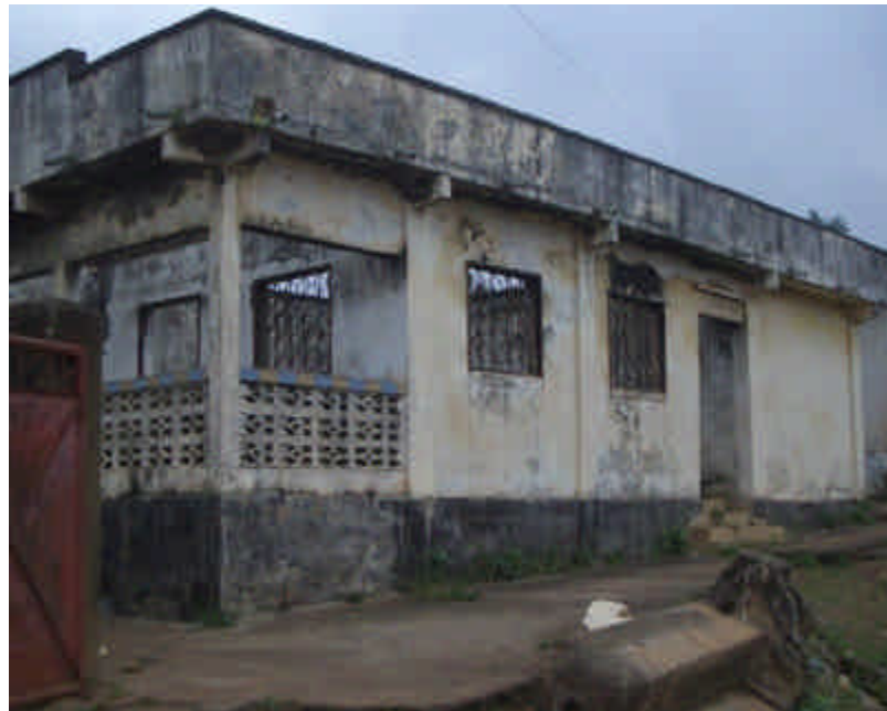
House destroyed during attacks on Guéckédou (Photo: Mpako Foaleng/Global IDP Project, November 2004)

In Guéckédou, at least 25 to 30 per cent of the returned IDPs are in need of food assistance and aid to rebuild their houses and sanitary facilities. The prefectures' services also need institutional support to carry out an assessment of IDP needs for complete rehabilitation (Prefecture Guéckédou, 25 November 2004). Although IDPs who have received assistance from the FAO/OCPH programmes to resume agriculture may start coping and slowly integrating into local communities, many others will continue to be dependent on host communities for survival.