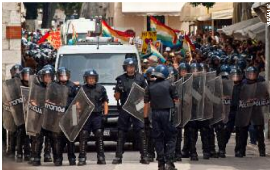
above: Split Pride 2011. Pride participants escorted by the police on Marmontova Street.

According to the organizers and to some participants, the police were not prepared for the level of violence that occurred. There