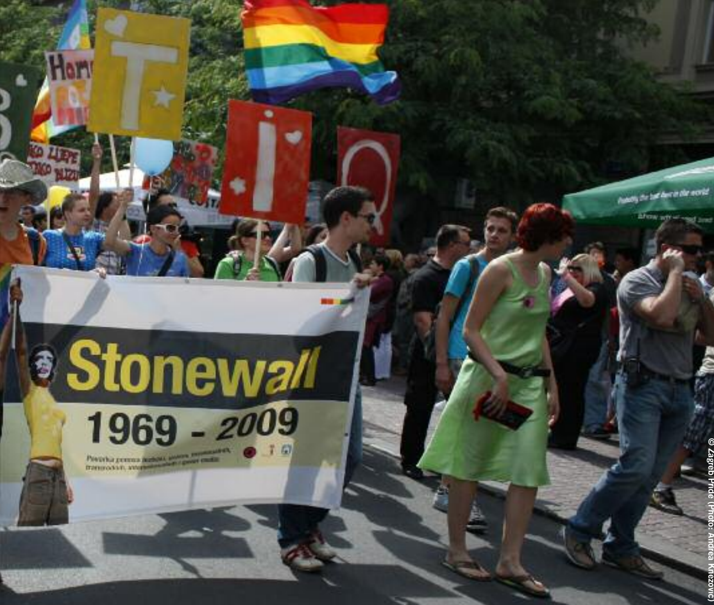
© Zagreb Pride (Photo: Andrea Knezović)