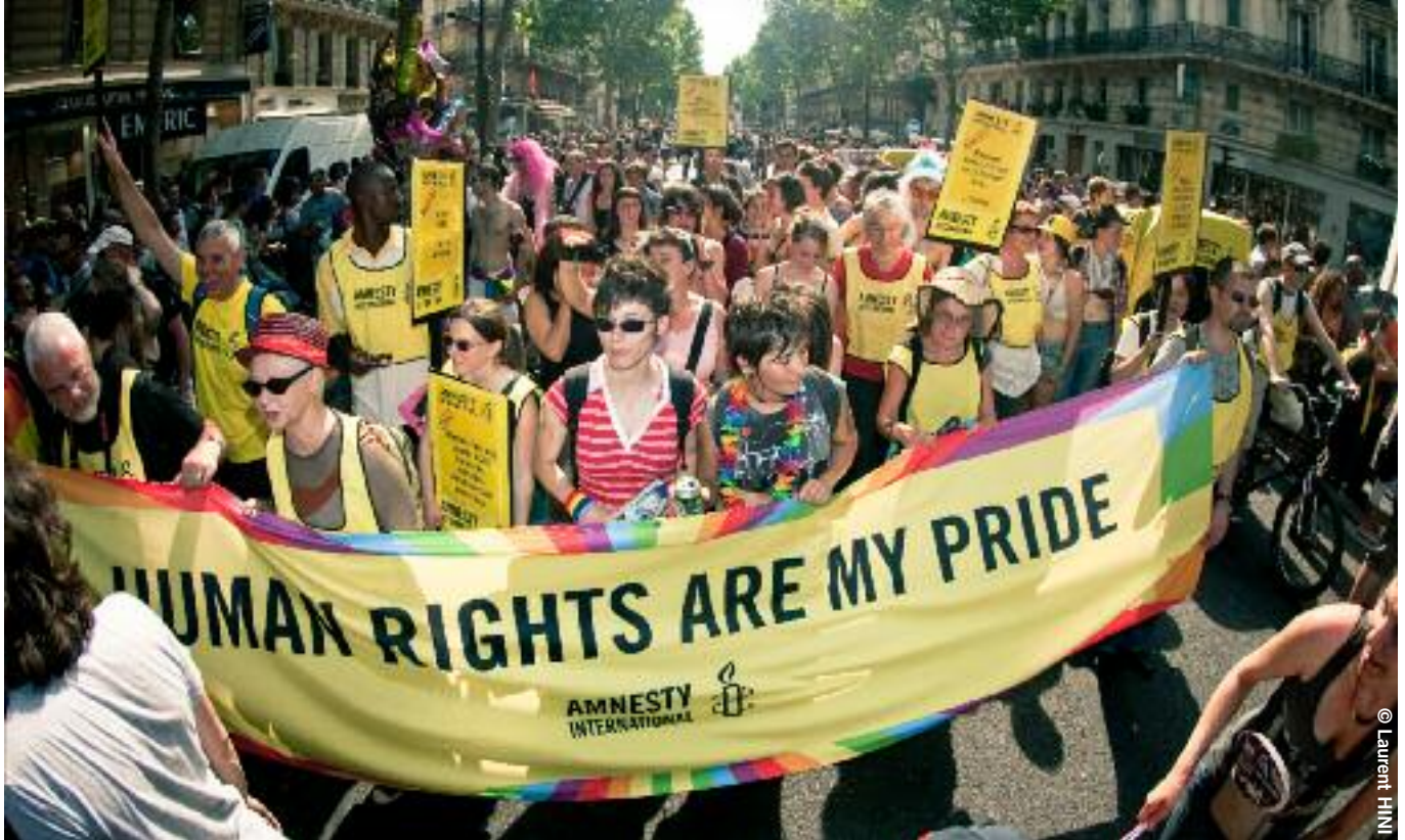
above: Amnesty International activists take part in Gay Pride in Paris, France, 28 June 2010.