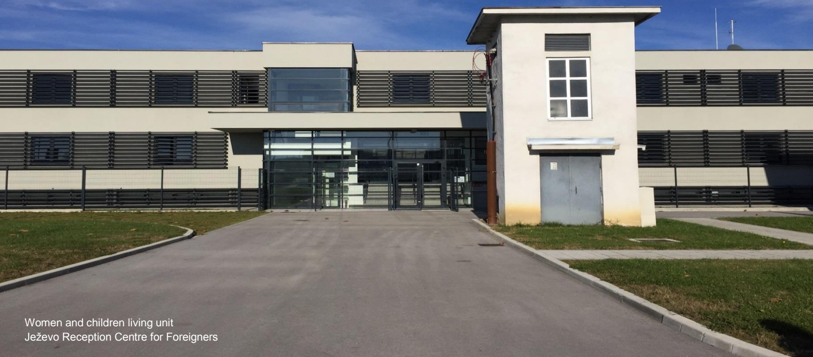
Women and children living unit Jezevo Reception Centre for Foreigners

While the number of detainees at the time of ECRE's visit was low, the occupancy rate of the wing reserved for single men fluctuates and has reached high levels earlier this year. In his visit to Croatia in late April 2016, the Council of Europe Commissioner for Human Rights urged the authorities to make use of the – then also empty – new facility to accommodate people whenever necessary to address situations of overcrowding in the dormitories for single men. 56 ECRE shares the view that it would be unacceptable to subject detainees to situations of overcrowding in the presence of unused and high standard facilities on the premises of Jezevo.