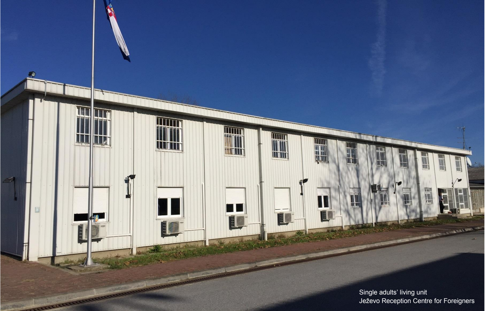
Single adults' living unit Ježevce Reception Centre for Foreigners