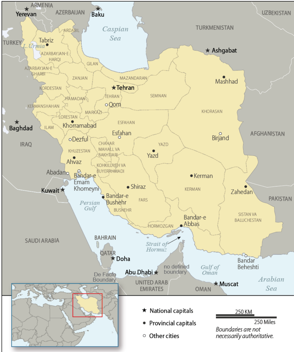
Figure 3. Map of Iran