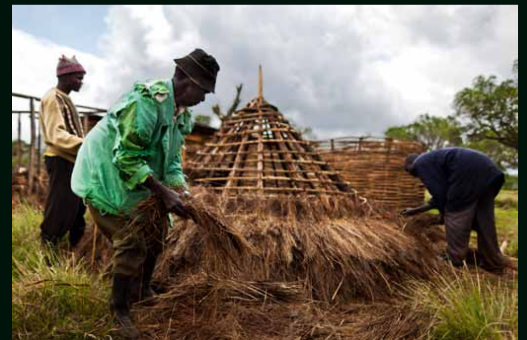
Residents of an illegal settlement in the Chepkitale region of Mt. Elgon build shelters.

The roots of the violence in Mt. Elgon lie in a land conflict that has been going on for several decades, starting in the 1960s when the government evicted thousands of Mt. Elgon residents from a forested area that was to be gazetted as a game reserve. Some of those affected were resettled but never received title to their land, while others remained landless. An effort to reallocate land initiated by the government in 2005, which would have reduced the land holdings of some members of the Sabaot sub-clan, led to the insurgency activities by the SLDF, which had already begun training several years earlier after the issue of land redistribution arose during the 2002 elections. To date, the conflict has not been resolved to the satisfaction of many residents of Mt. Elgon, raising the specter of future violence — particularly if the culprits of the 2006-2008 violence continue to benefit from impunity.