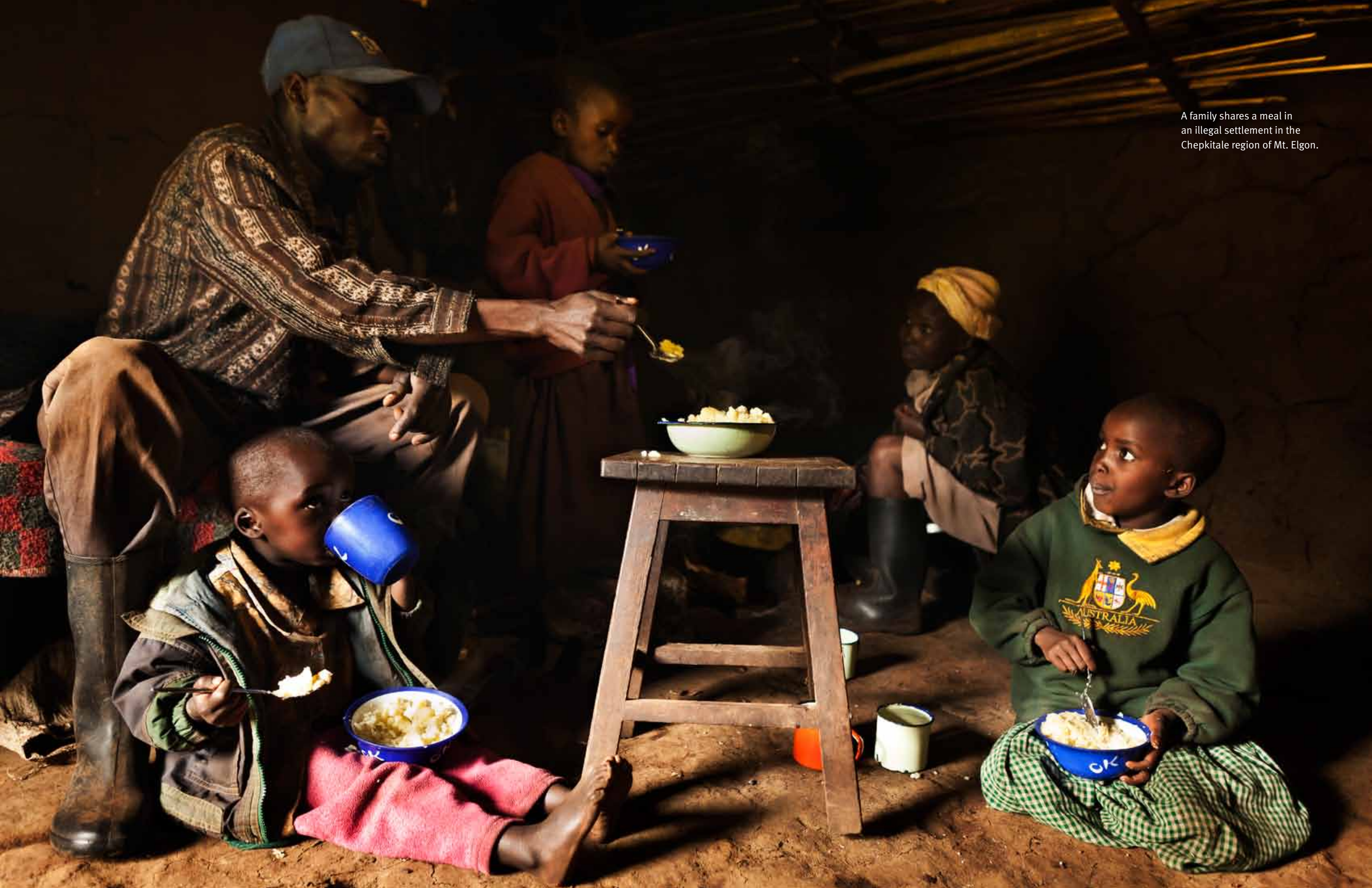
A family shares a meal in an illegal settlement in the Chepkitale region of Mt. Elgon.